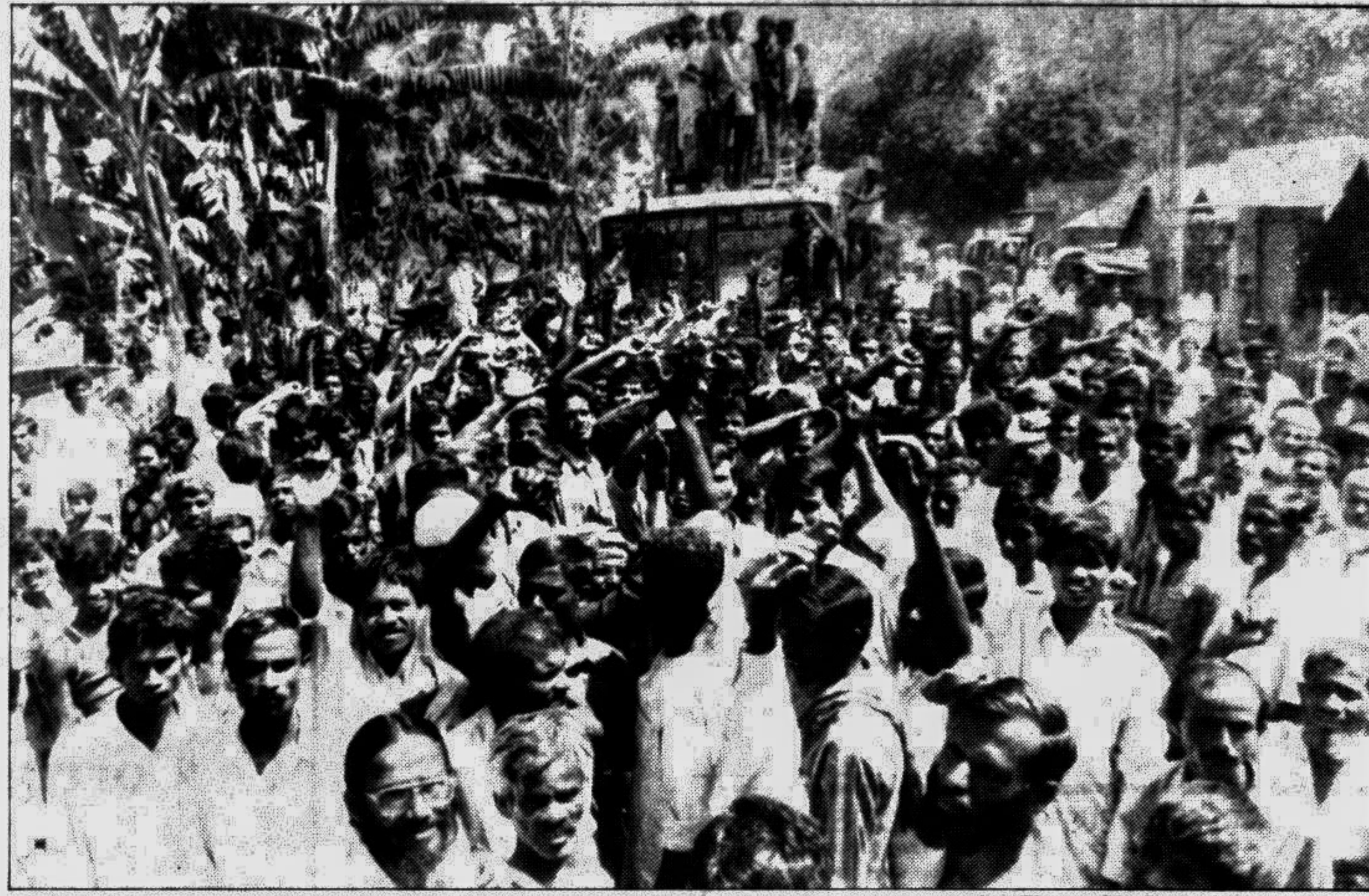
Agitated farmers assembled in front of the Ghoradara Union Parishad of Jamalpur Sadar Thana, blocking the road to traffic for several hours yesterday. They also gheraoed the UP chairman and a thana magistrate, demanding fertiliser at fair price.

The Dhaka divisional council conference-95 of the BNP scheduled to be held on March 29 has been deferred due to unavoidable reason, a party press release said last night. The conference will now be held on April 29, reports BSS.