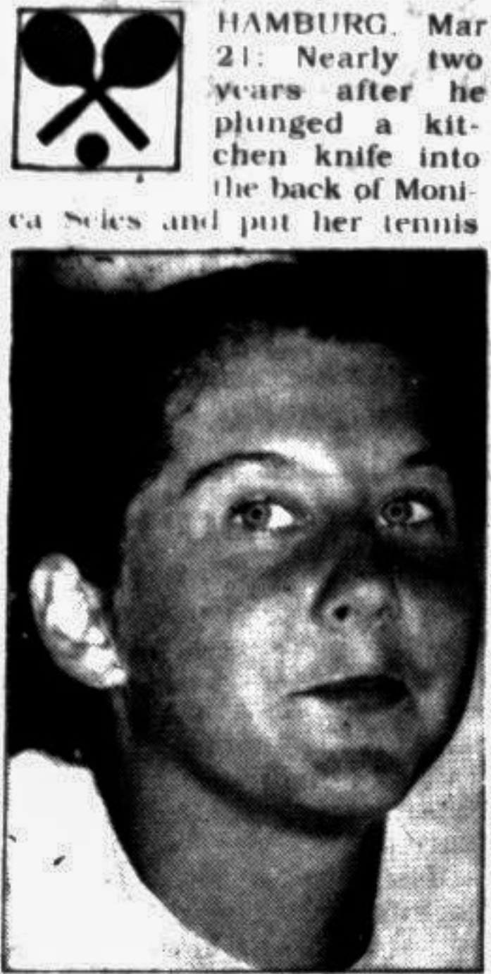
MONICA SELES career on hold, the assailant went on trial again Tuesday, reports AP.