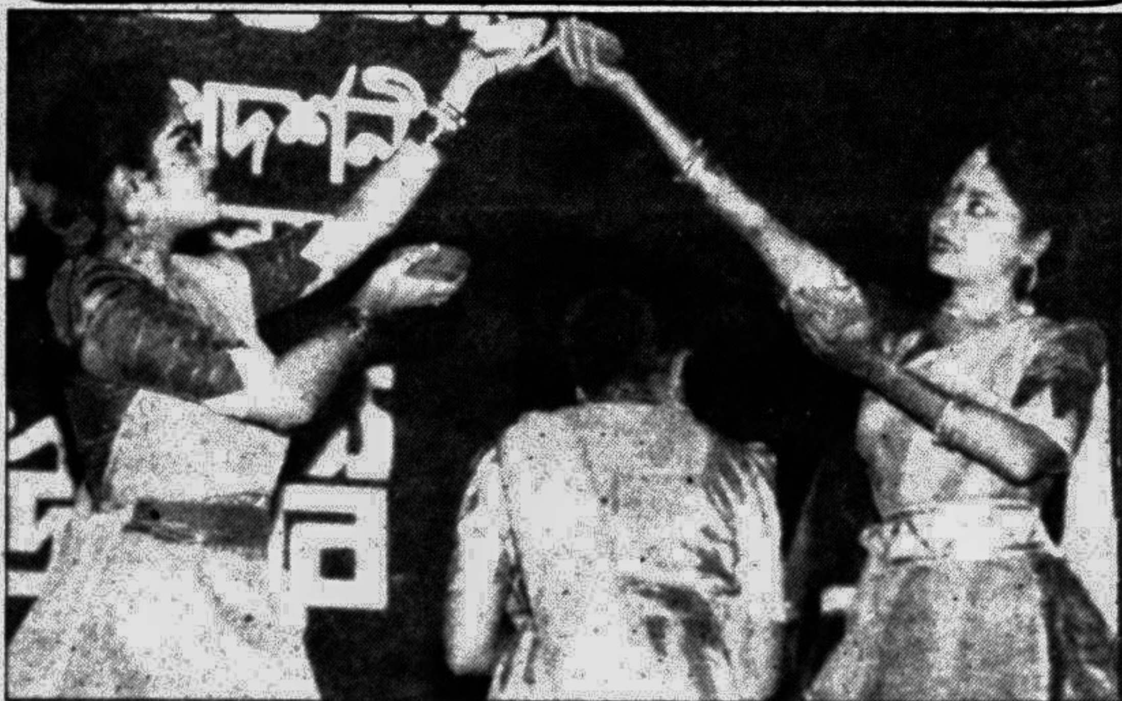
A spectacular number of the dance-drama Nataraj , held at the Guide House auditorium in the city yesterday. The drama was performed as part of the ongoing drama week, organised by the Theatre — a leading drama troupe, to mark the 1000th show of its production.