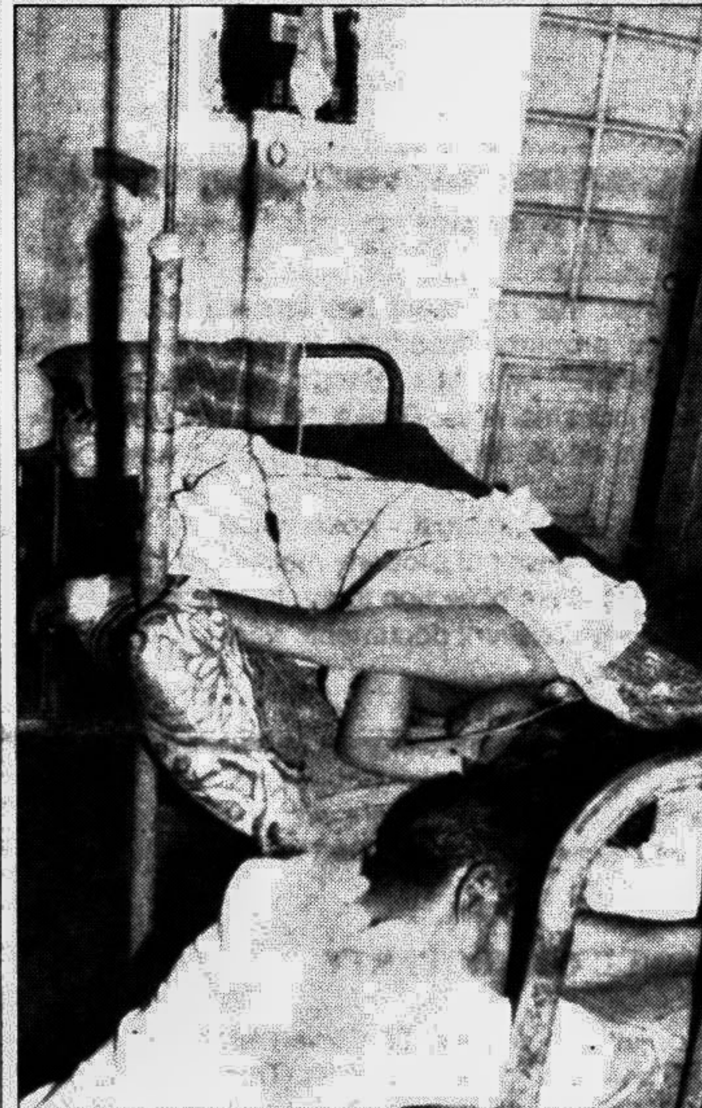
This patient at the Dhaka Medical College Hospital was left under the care of a sleeping attendant yesterday as nurses continued their country-wide strike.

Finance Minister M Saifur Rahman left for Washington last night for a pre-Aid Club consultation with the officials of World Bank where he is expected to reassure the WB of Bangladesh's total commitment to reforms, reports UNB. An Economic Relations Division (ERD) source said the issue of current slowdown in reforms, as alleged by the World Bank in its country memorandum for next month's Aid Club meeting, is most likely to crop up during scheduled consultations. See Page 12 Col 2