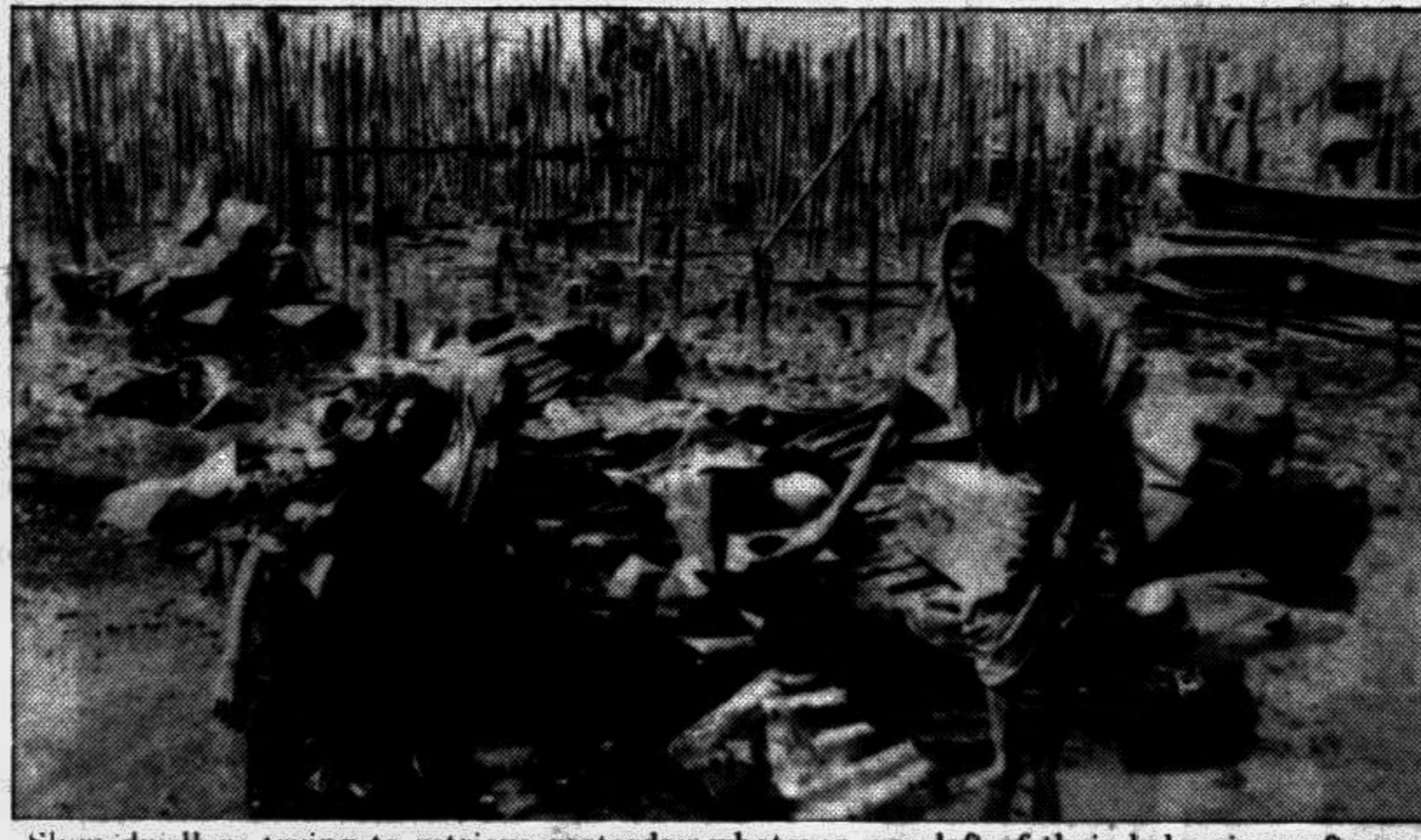
Slum dwellers trying to retrieve yesterday whatever was left of their belongings after a devastating fire Sunday razed their shanties in Islambagh in the city.