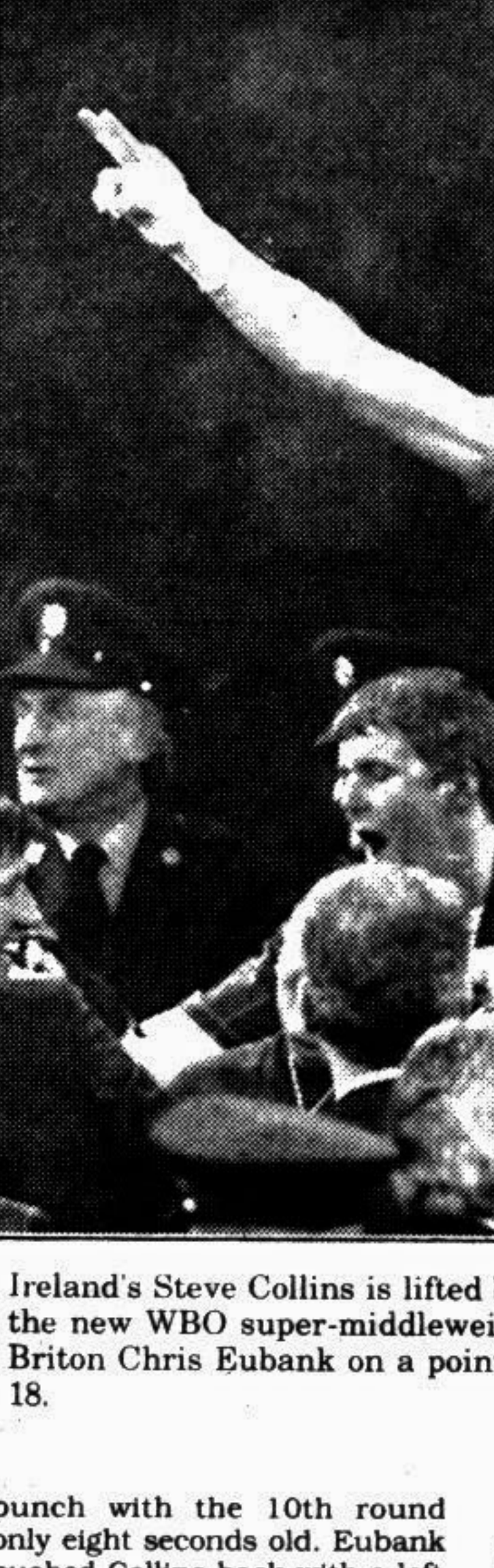
Ireland's Steve Collins is lifted by supporters after becoming the new WBO super-middleweight champion by dethroning Briton Chris Eubank on a points decision in Dublin on Mar 18.

backward roll on the canvas. Eubank, apparently well down on points at that stage, was more aggressive in the next round but also took some good combinations from the challenger.