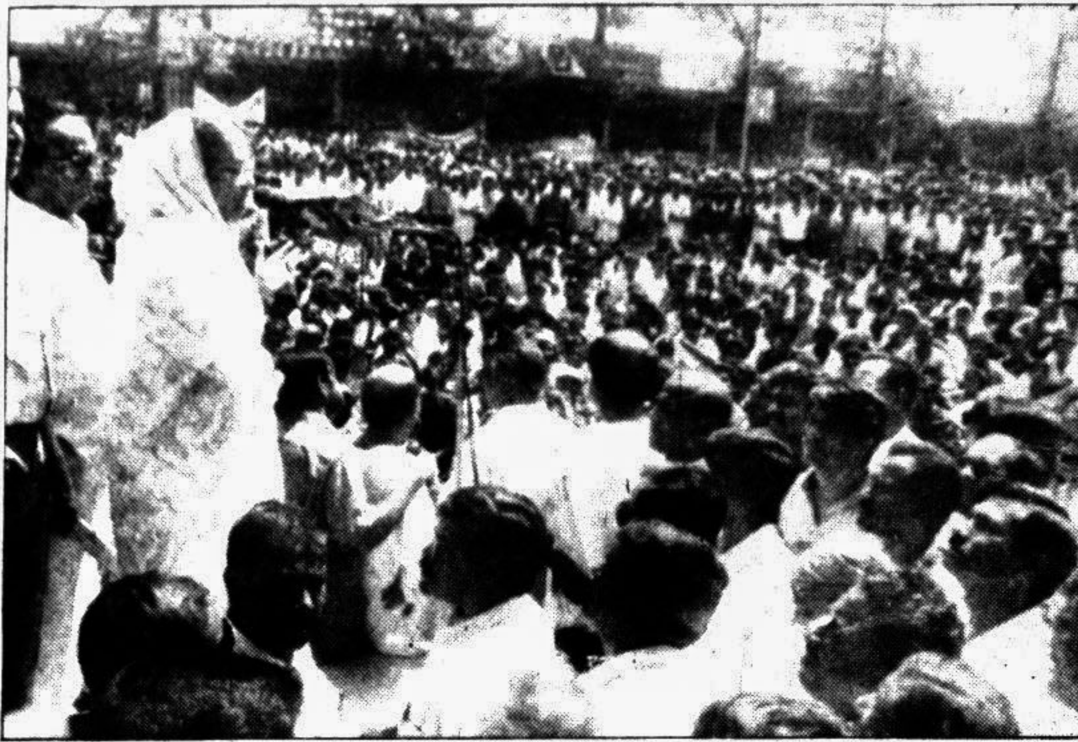
Awami League chief Sheikh Hasina addressing a rally at the Bangabandhu Avenue area prior to party's Food Directorate gherao programme in the city yesterday.