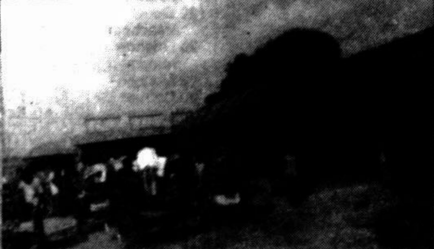
GAIBANDHA: A wagon of a goods train rammed into a shop after it derailed during shunting at Mohinaganj recently.

The boats were later sold in a public auction. The fishermen each was fined Tk 100 for the crime. The arrested fishermen hailed from Chandpur, Munshiganj, Saratpur, Bhola, Barisal, Maniganj and Dhaka. It may be mentioned, hilsa fish fry are caught from the river Meghna and Padma during this time of the year.