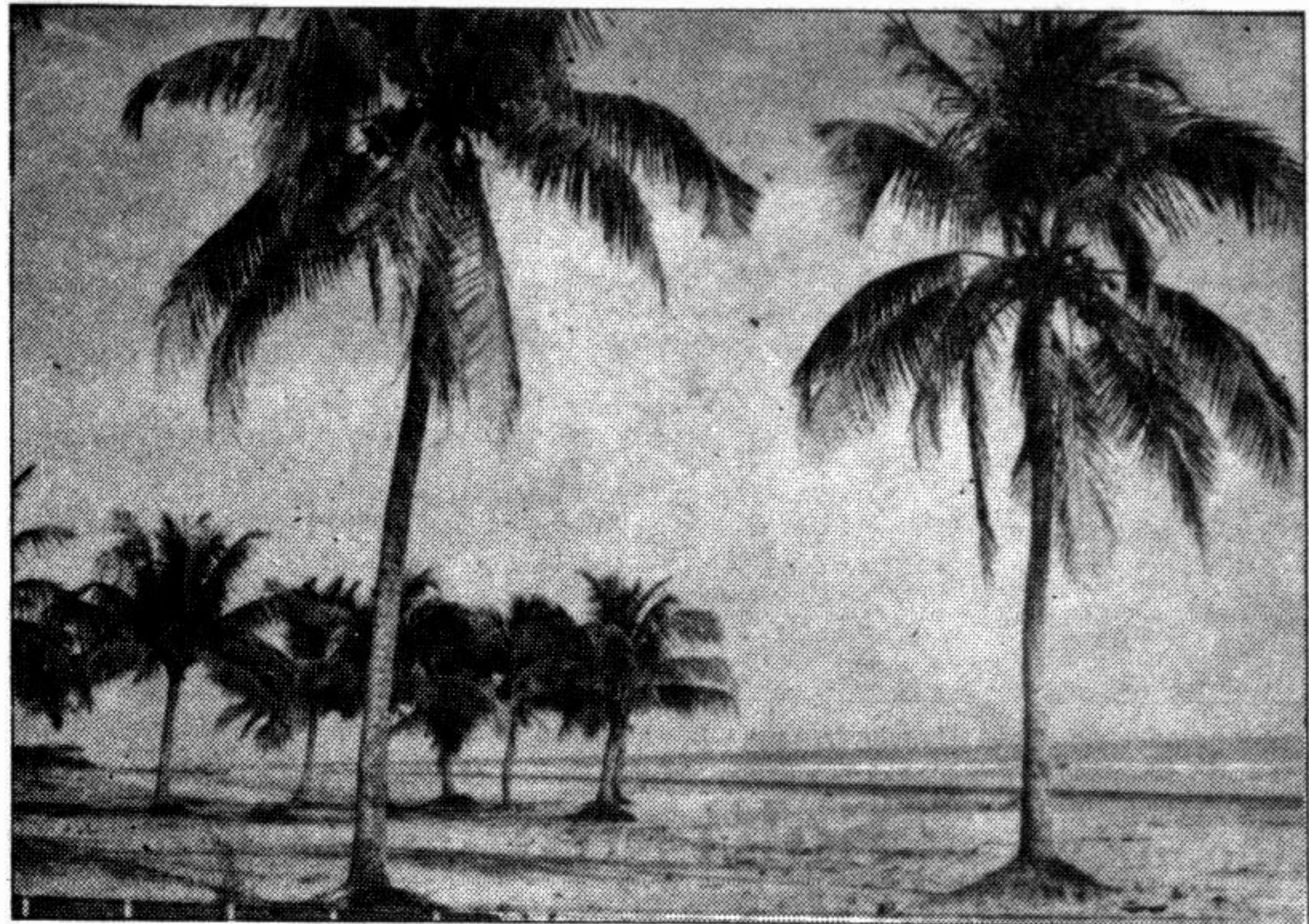
KUAKATA (Patuakhali): Rows of coconut trees along the coast of Bay of Bengal.

Transportation facilities to and from Kuakata is hazardous