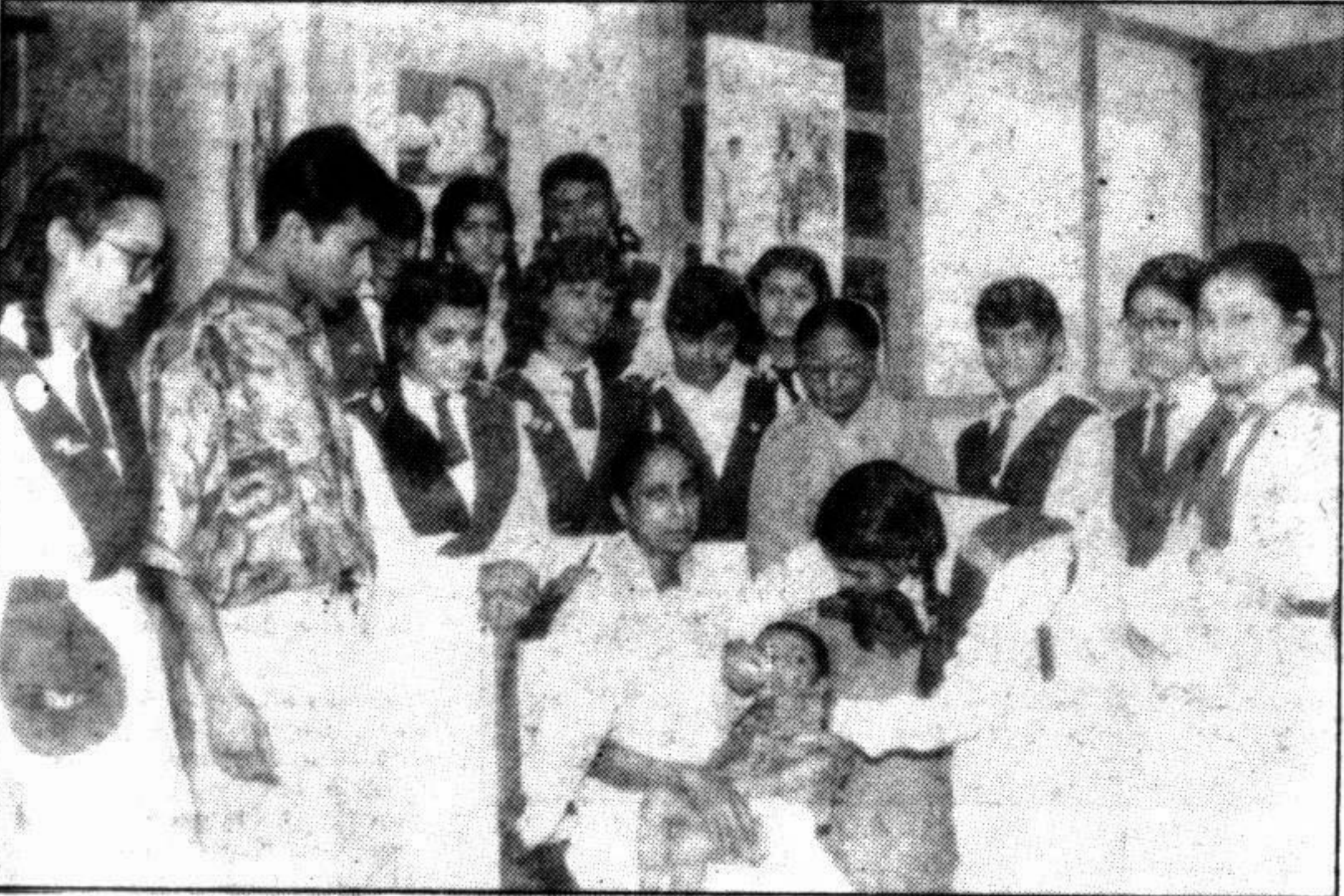
SYLHET: Children are being immunised at a centre by the volunteers of Girls Guide on the first day of National Immunisation Day.

There is possibility as well as ample scope of producing cashnuts at Kuakata, local people said.