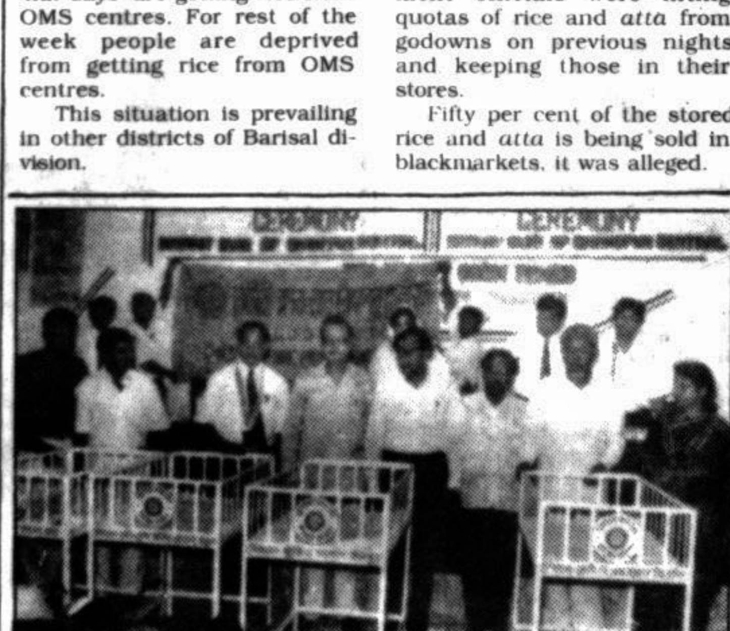
CHANDPUR: Some baby-cots were donated by the Chandpur Rotary Club to Chandpur hospital recently.

Fifty per cent of the stored rice and atta is being sold in blackmarkets, it was alleged.