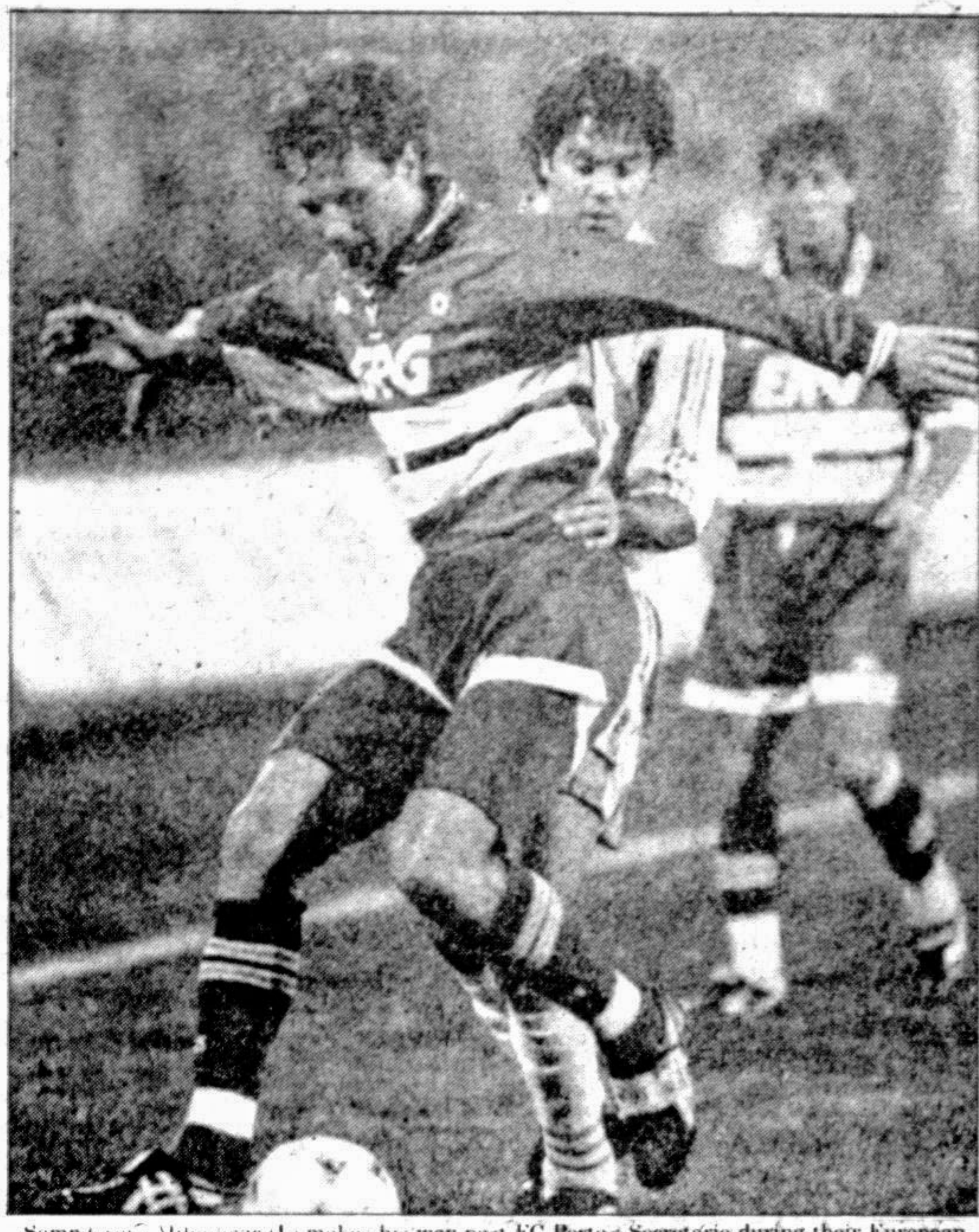
Sampdoria's Mihajlovic (L) makes his way past FC Porto's Secretario during their European Cup Winners' Cup match in Oporto, Portugal on Friday. Sampdoria advanced to the last four.

PIRAEUS, Greece, Mar 17: Olympiakos Piraeus beat CSKA Moscow 79-54 on Thursday, and became the second Greek team to advance to the final four of the European Basketball Championship in Spain next month, reports AP.