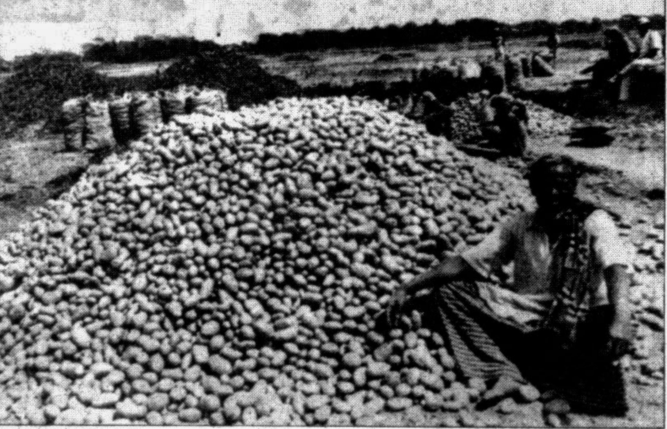
AT WITS' END: A farmer casts a vacant look sitting by a mountain of just harvested potatoes at a field in Munshiganj yesterday.