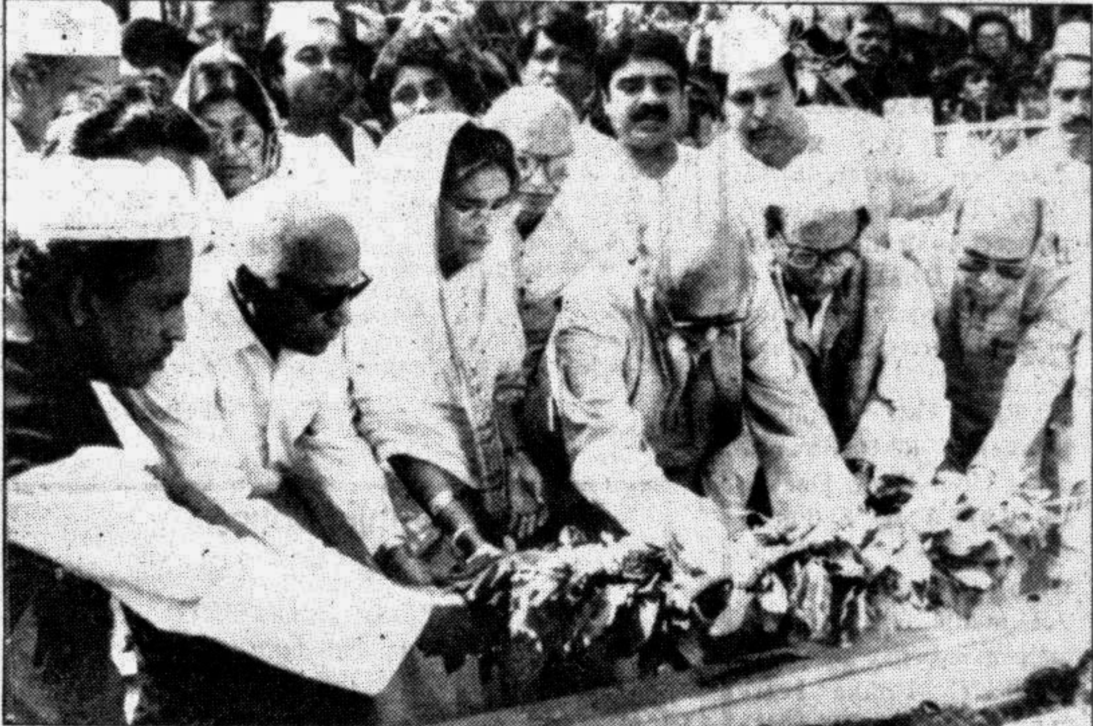
Awami League chief Sheikh Hasina along with other party leaders, intellectuals and student leaders placing wreath at the mazar of Bangabandhu Sheikh Mujibur Rahman at Tungpara in Gopalganj on the late leader's 75th birthday yesterday.

CHITTAGONG, Mar 17: The Chittagong Port Authority has constituted a 19-member consultative committee to ensure operational improvement in the port which handles over 80 per cent of the country's imports and exports. The committee, headed by the port Chairman, includes representatives from the Chittagong Chamber, the FBCCI, BGMEA, the stevedores' association, the steamers' association, the clearing and forwarding agents and other organisations. According to port sources, the committee will meet once a month to review the operational activities of the port and suggest ways of raising the efficiency of cargo handling. Meanwhile, increase in the See Page 12 Col 1