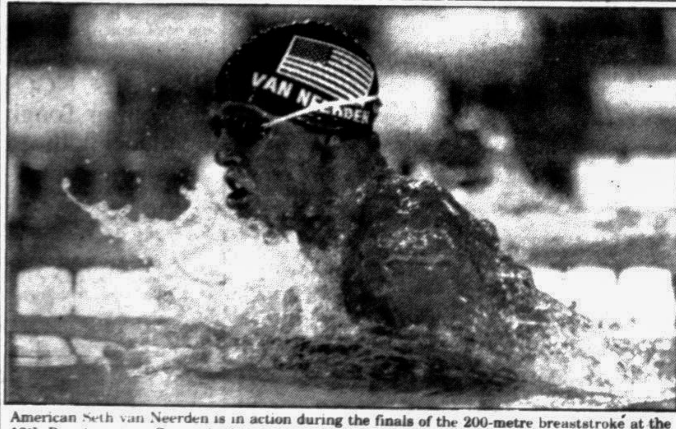
American Seth Van Neerden is in action during the finals of the 200-metre breaststroke at the 12th Pan-American Games in Argentina yesterday. Van Neerden won the gold medal with a time of 2:16.08.