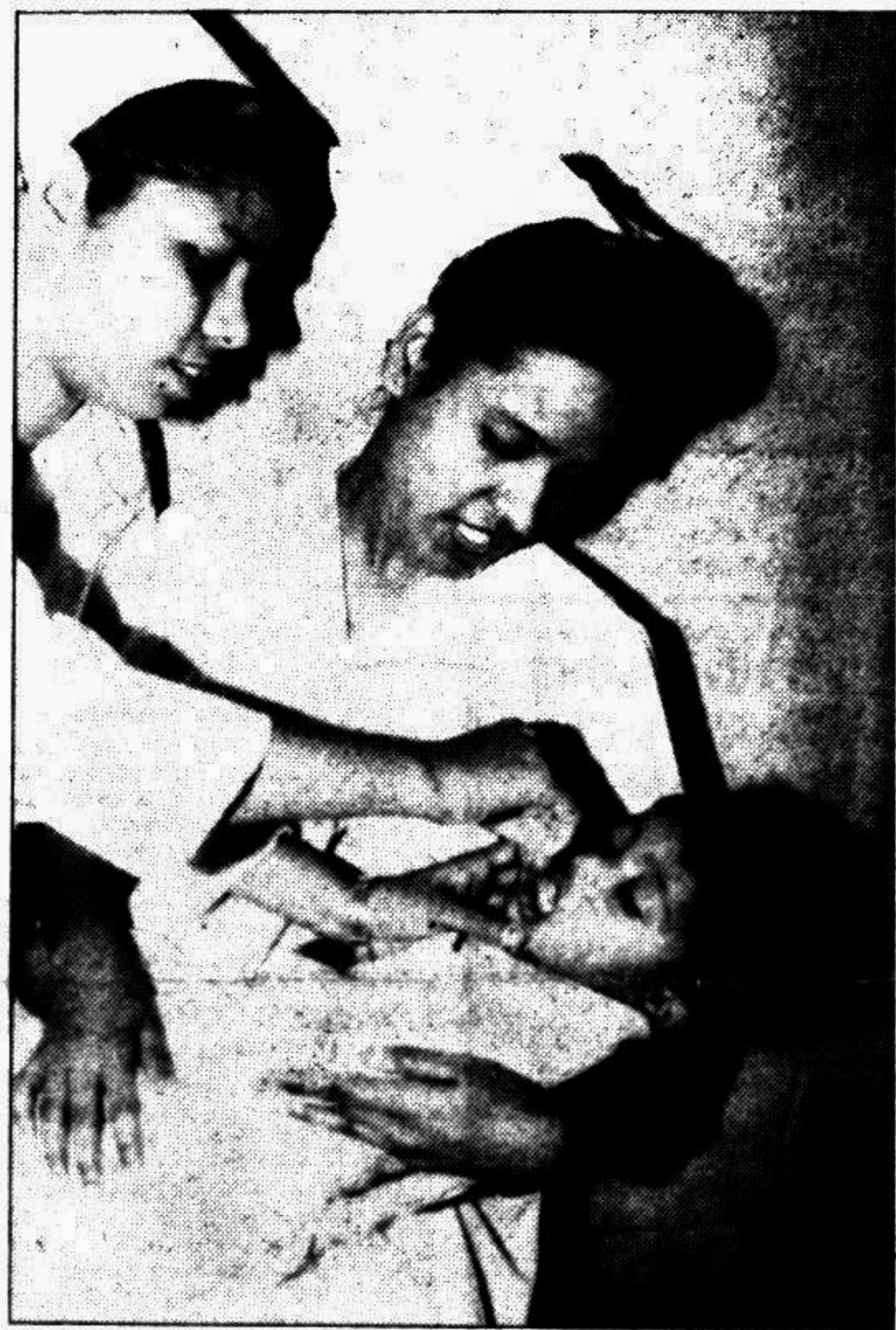
Nurses administering an anti-polio dose to a child at a city centre as part of the National Immunisation Day yesterday.

The Dhaka Rotary Club and Rotaract Club of Bangladesh jointly organised two separate polio centres at the Cancer Institute and Research Hospital premises yesterday where children were vaccinated.