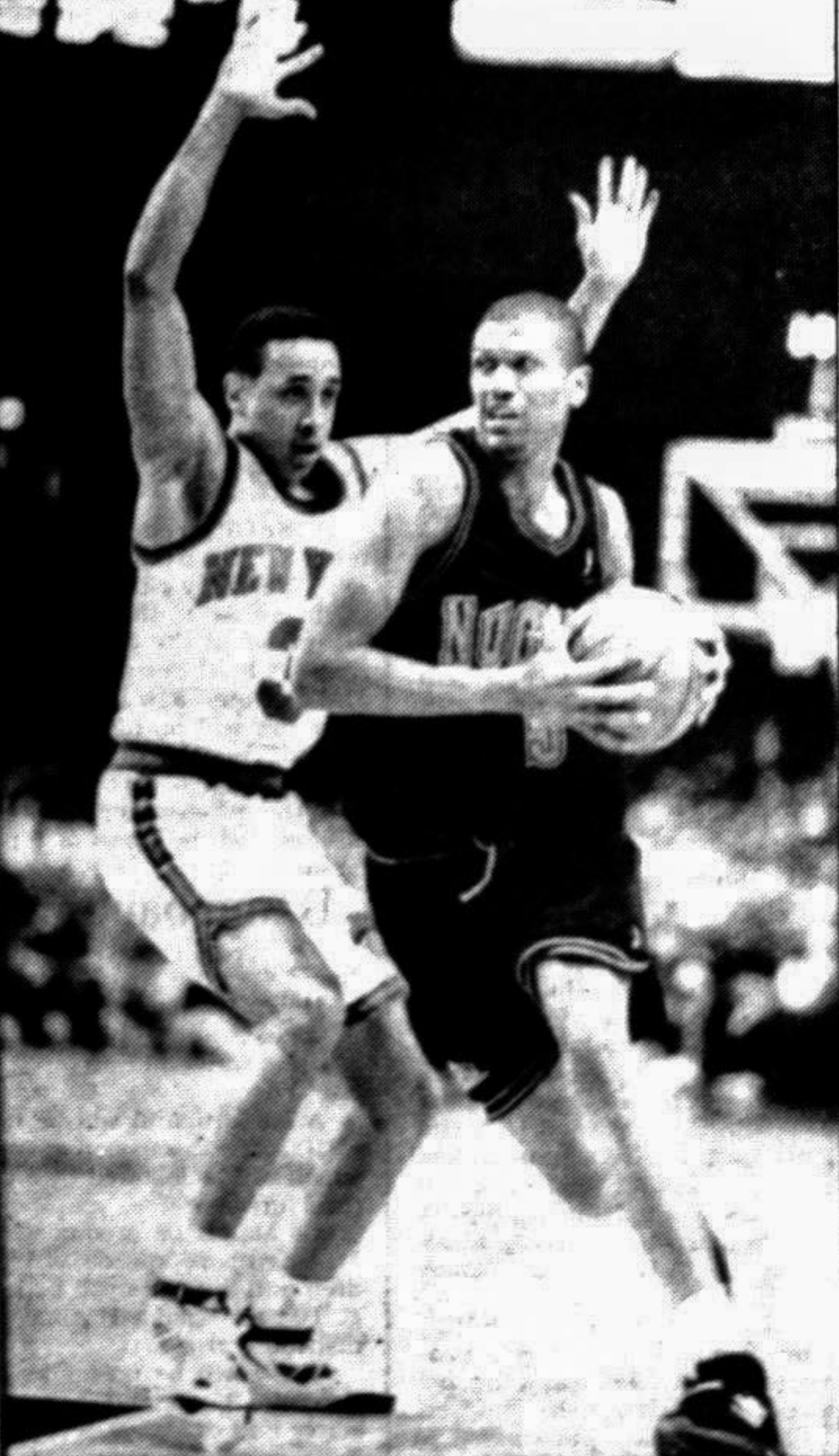
Denver Nuggets Jalen Rose (R) tries to get past New York Knicks' John Starks during their NBA game in New York on March 14. The Knicks won 94-74.

BONN, Mar 15: Boris Becker signed a three-year contract worth almost seven million dollars here on Tuesday to promote tennis in Germany, reports AFP. The deal did not commit the world number three to playing Davis Cup for Germany although Becker said he was ready to represent his country if his interests were taken into account. Becker, who turned down a wild card for Key Biscayne on March 17-23, will play for Germany in their Davis Cup quarter-final against Holland at Utrecht on March 31-April 2. The German Federation will pay 2.6 million marks of the 3.1 million mark (2.2 million dollars) annual contract. The remaining 500,000 marks will be raised from TV rights. Becker will be involved in tennis clinics for youngsters as well as promotional work.