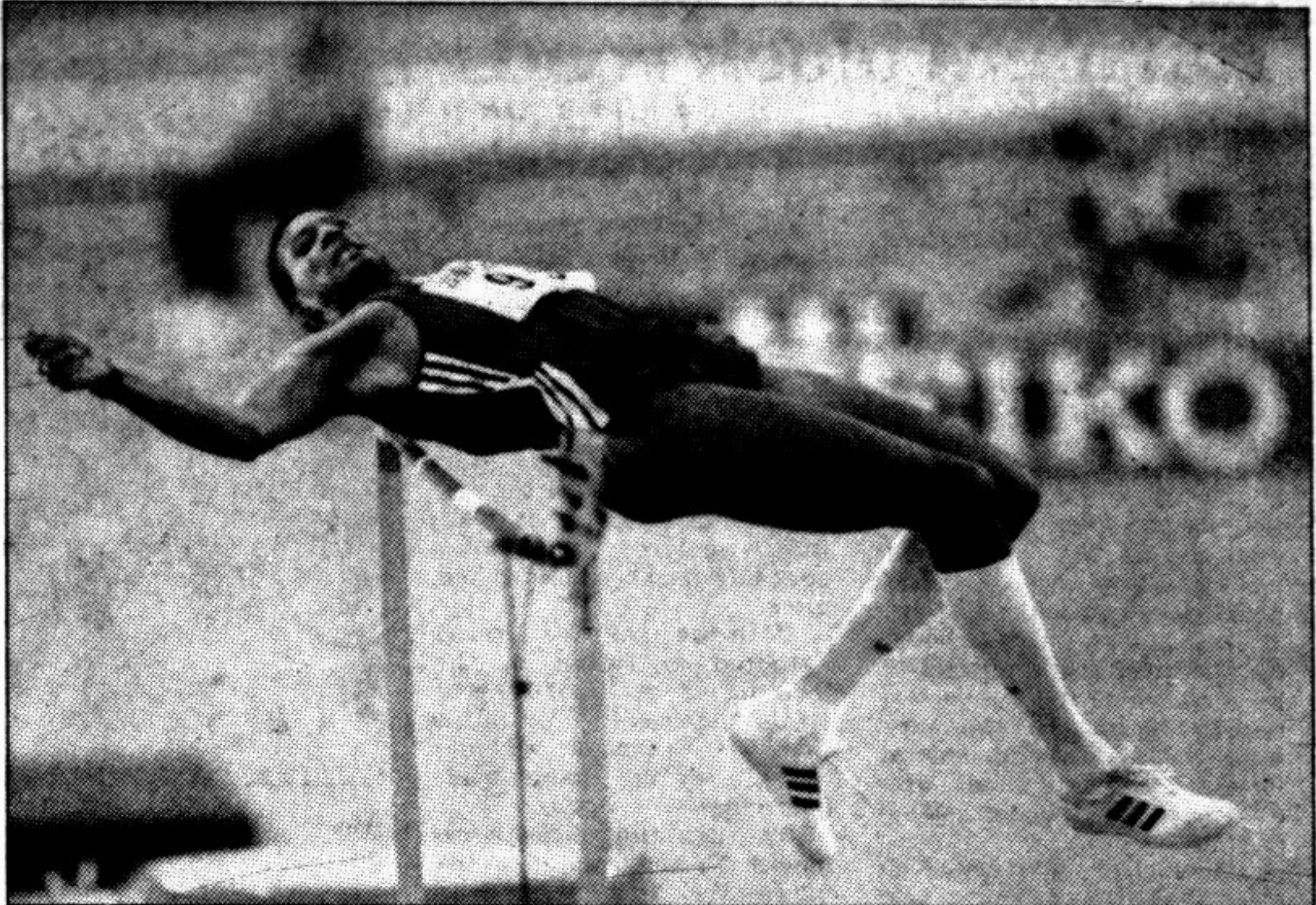
Cuban Javier Sotomayor soars over the bar to win the men's high jump competition at the fifth World Indoor Athletics Championship in Barcelona on Mar 12.

Not in Olympics MAR DEL PLATA, Mar 14: Olympic chief Juan Antonio Samaranch said on Monday he would not oppose prize money at major athletics championships, but would object to payments to athletes at the Olympic Games, reports Reuter.