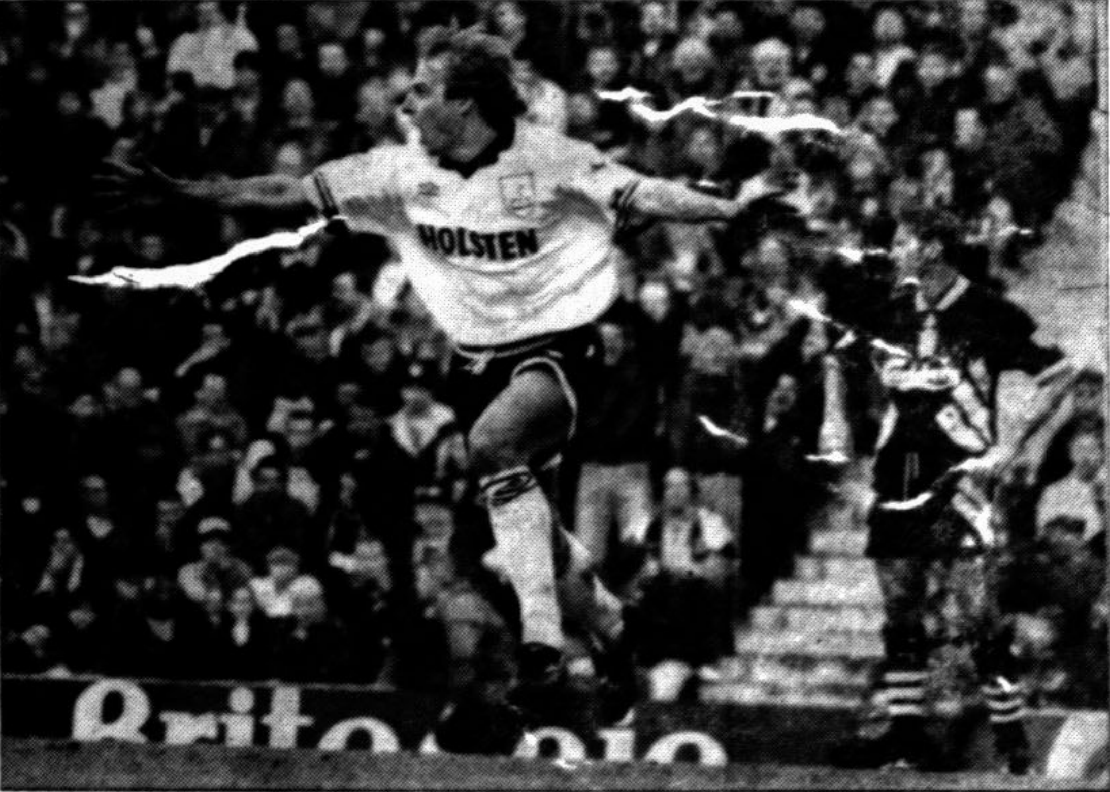
Spurs forward Juergen Klinsmann is ecstatic after scoring a goal during the FA Cup sixth round encounter against Liverpool at Anfield on March 11. Spurs won 2-1.