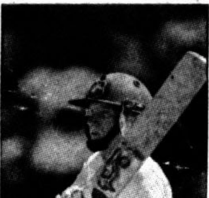
IAN HEALY ... m-o-m

Pacemen Paul Reiffel, who took three for 32 from his 10 overs, and Craig McDermott, with three for 37 in 6.5, cleaned up the middle and lower orders, the last seven wickets tumbling for 59. Australian wicketkeeper Ian Healy was named man-of-the-match after flogging 51 runs from 45 balls as the touring team rushed to 260 for eight off their 50 overs.