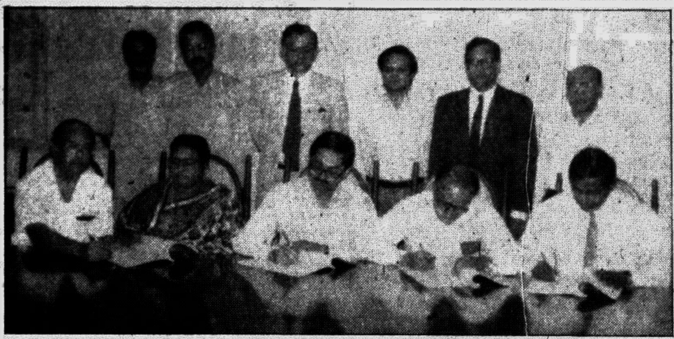
Members of the consortium of Sonali, Janata and Agrani Bank seen signing the agreement at the Sonali Bank head office in the city on Saturday.

He said such projects would ease the problem of unemployment in the country, while talking to a group of teachers of the Akbar Ali Khan Technical College of Comilla when they called on him at Bangabhaban.