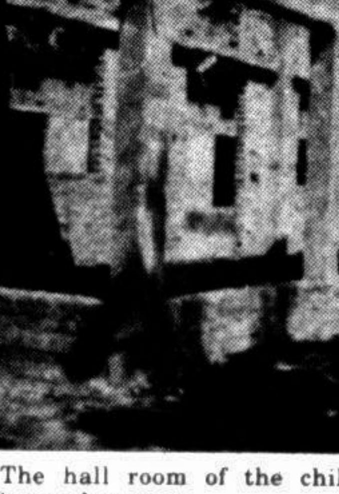
The hall room of the children's paradise remains in incomplete stage.

children by creating environment congenial to development of their faculties of fine arts and cultural beauty. He said, SM Sultan is no more but his remaining task