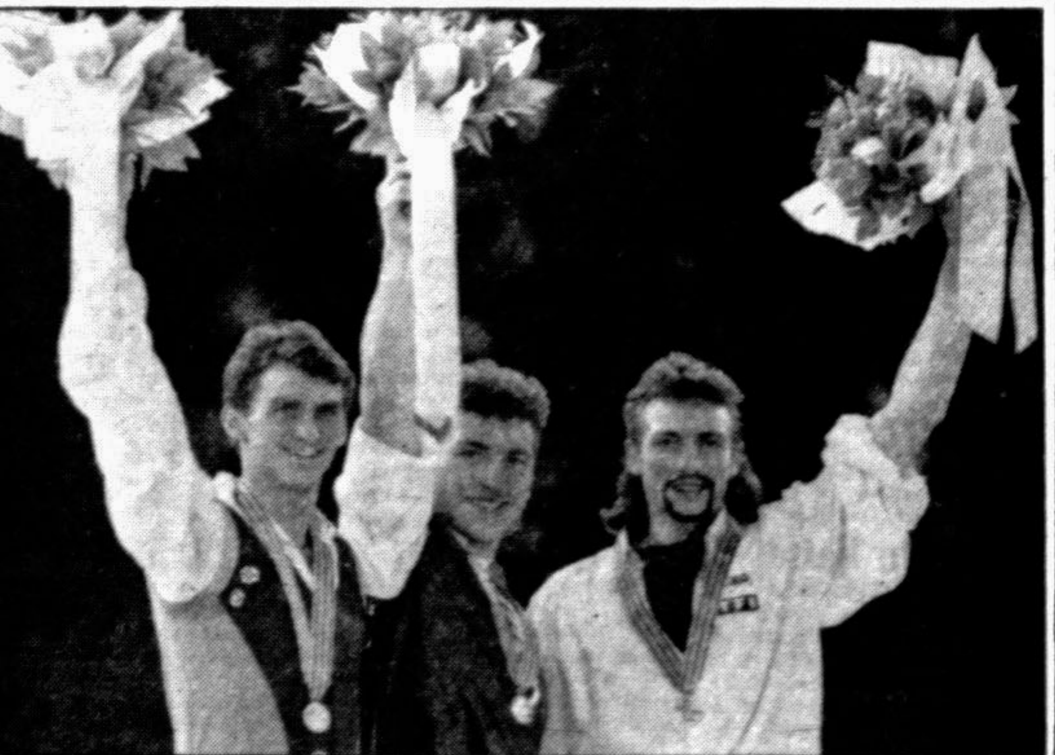
Gold winner Elvis Stojko of Canada flanked by American Todd Eldredge (Silver, L) and Frenchman Philippe Candeloro (bronze, R) wave bouquets from the podium after the men's competition of the World Figure Skating Championship in Birmingham on March 9.

0 just 19 minutes into the match, which he ended in 65 minutes. "It wasn't me underestimating him before, he's just beaten me a couple of times," Agassi said. The second round was completed earlier in the day with six matches including the Sampras-Bjorkman match, and there were two upset — No. 10 seed Andre Medvedev of Ukraine lost to David Wheaton 4-6, 6-2, 7-6 (7-4), and No. 13 Andrea Gaudenzi of Italy was beaten by Marcelo Rios of Chile 6-3, 6-0. In other second-round play, No. 11 Stefan Edberg of Sweden beat Arnaud Boetsch of France 6-3, 6-4; No. 12 Magnus Larsson of Sweden topped Lionel Roux of France 6-2, 6-2; and No. 15 Patrick Rafter of Australia outlasted Tommy Ho 6-3, 2-6, 7-5. In the first third-round match of the tournament, No. 7 Wayne Ferreira of South Africa breezed past Carlos Costa of Spain 6-3, 6-2. Costa had upset No. 9 Jim Courier on Wednesday.