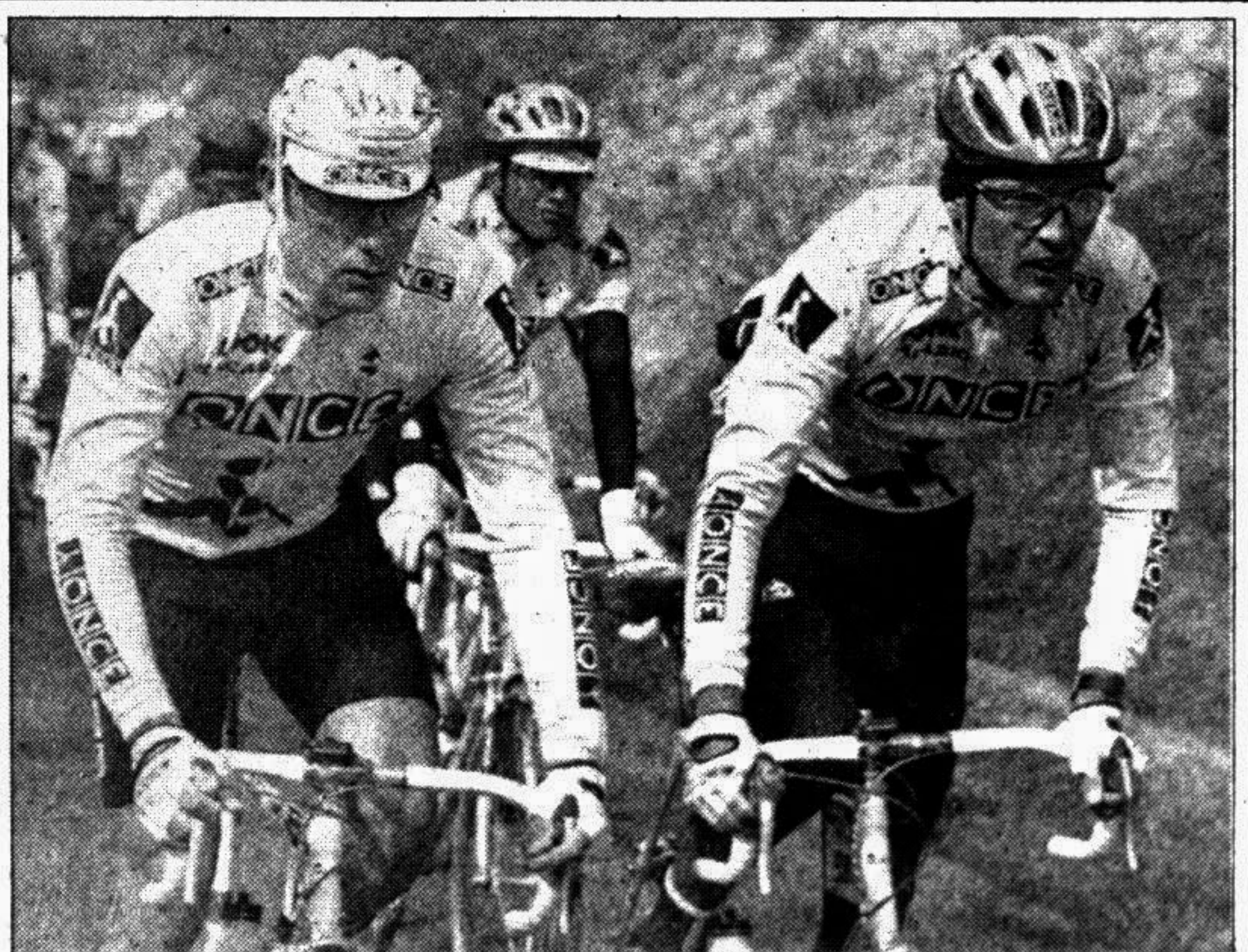
Frenchman Laurent Jalabert (L) leader in the overall standings, cruises with his teammate Switzerland's Alex Zülle (R) during the fifth stage of the 62nd Paris-Nice race between Murat and Saint Etienne on March 9. American Lance Armstrong won the stage.

Bowe is getting $1 million, but should he win, he will get $10 million to fight Jorge Luis Gonzalez, a Cuban living at Las Vegas, on June 17 at the MGM Grand.