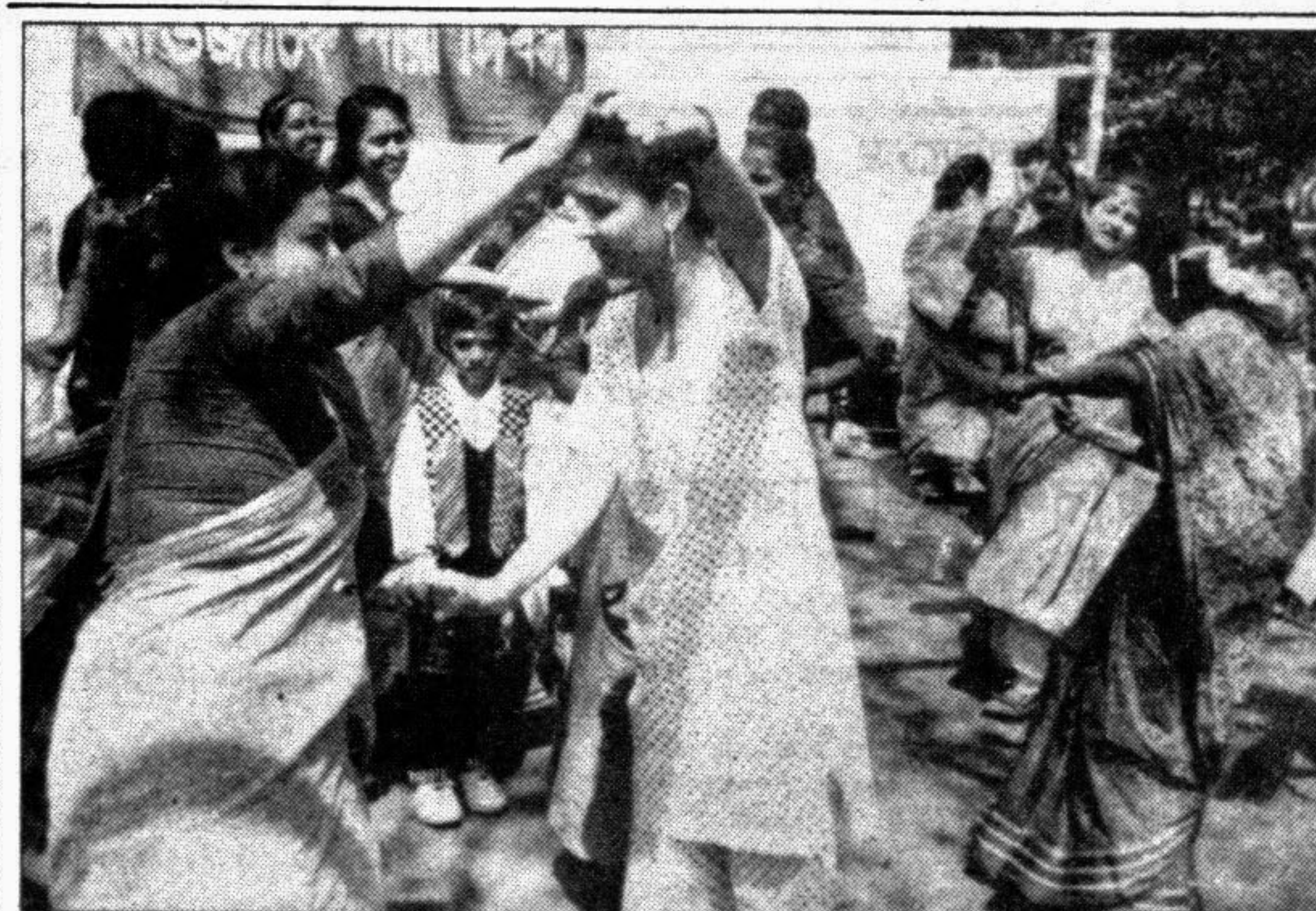
DANCE AS YOU LIKE: International Women's Day Celebration Committee organised a function at the city's Ramna Balamul yesterday.