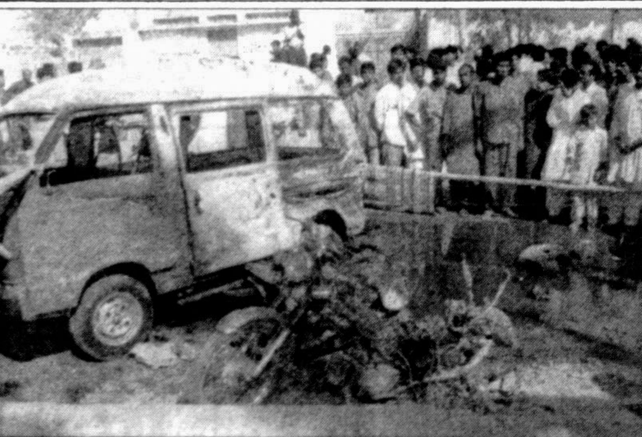
People gather around a destroyed motorcycle and a car at the site of a bomb blast which killed 10 in front of a Shiite mosque in Karachi during Juma prayers yesterday.