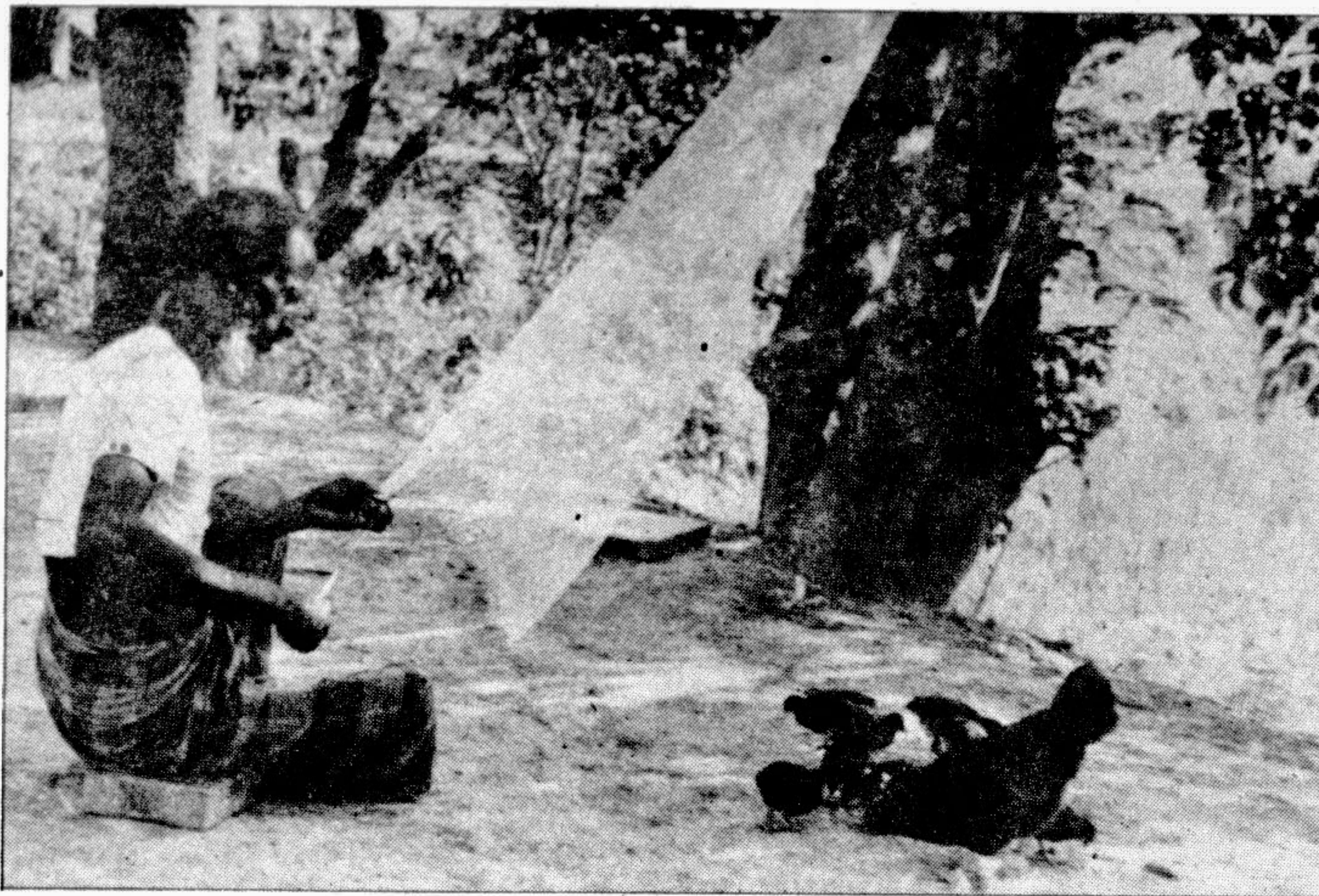
A farmer in Dohar thana of Dhaka district weaves his fishing net ahead of the advent of the monsoon.

Falta, who took part in the gherao programme, said that they have been facing untold suffering due to price hike of fertiliser and other agri-inputs. They alleged that some influential persons are procuring the fertiliser from the concerned authorities illegally and selling it to the businessmen at high rate. They also said Irri-boro cultivation in the 16 northern districts including Gaibandha is being hampered due to high prices of agri inputs. The agitating farmers urged the concerned authorities to ensure smooth supply of fertilisers at fair price and check the price rise without further delay.