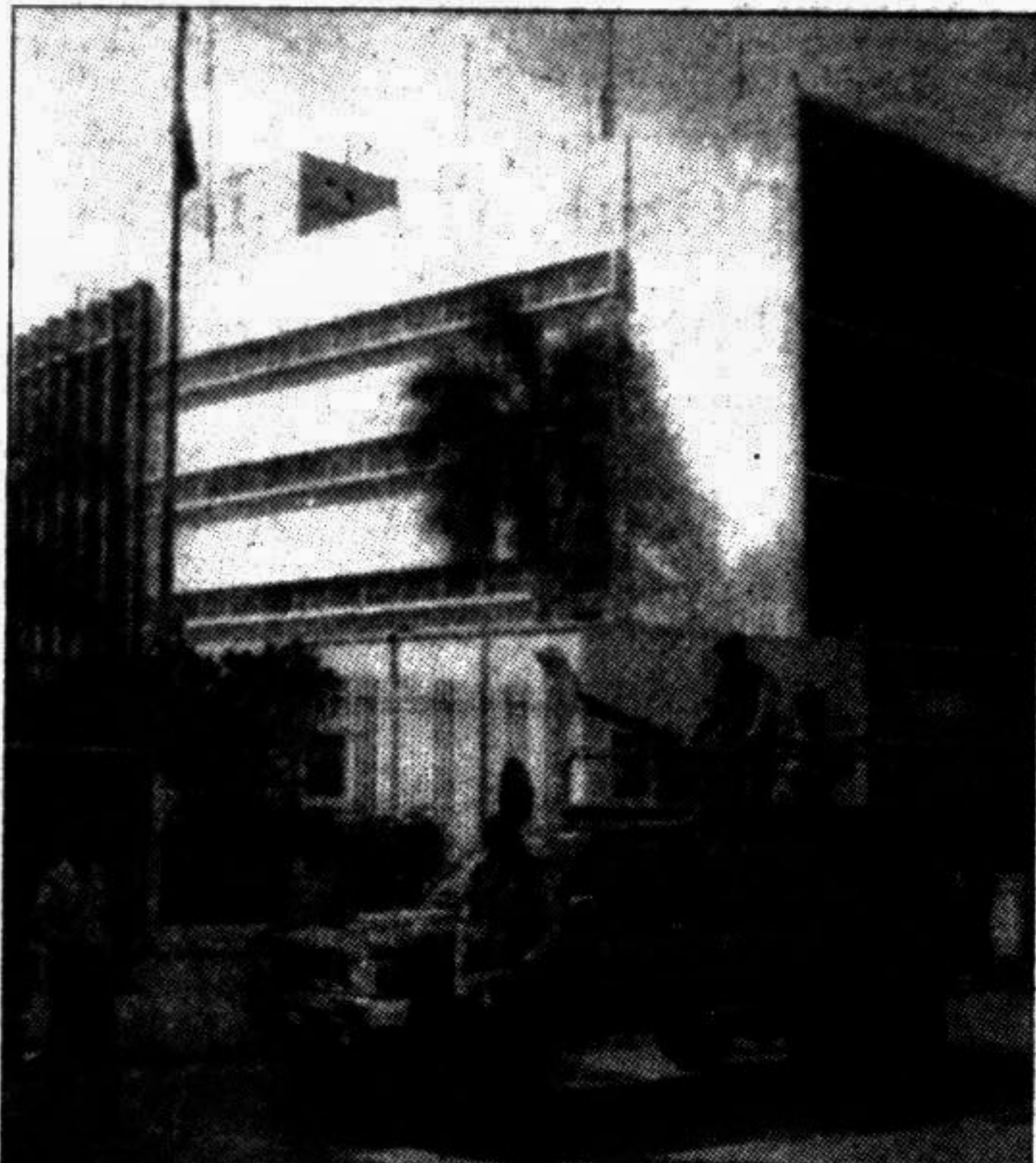
Pakistani paramilitary troops guard the US Consulate General in Karachi after two American staff were shot dead by unidentified gunmen yesterday.

KARACHI, Mar 8: Two gunmen burst out of a taxi today and sprayed bullets at a van carrying three US government workers, killing two and wounding the third, reports AP.