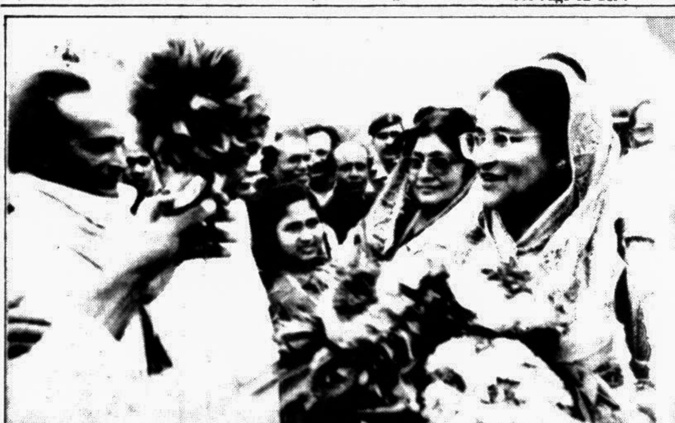
Awami League chief Sheikh Hasina was accorded a warm reception at Rajshahi airport yesterday when she arrived to attend the Divisional AL workers' conference.

Finance Minister Saifur Rahman said massive pro- See Page 12 Col 4