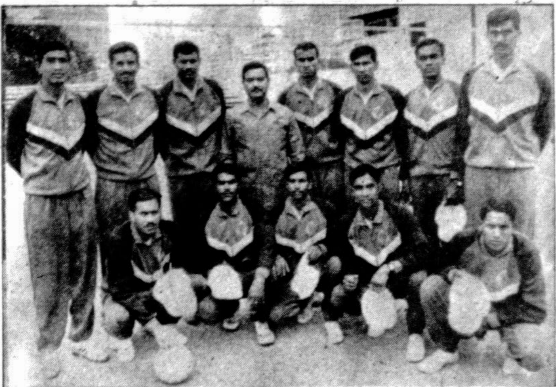
Players and officials of Bangladesh Rifles, who won the Top Five championship, organised to celebrate volleyball's centenary.

Meanwhile, in the other match of the day, Dipali Juba Sangha edged past Sunrise SC by the odd goal in three.