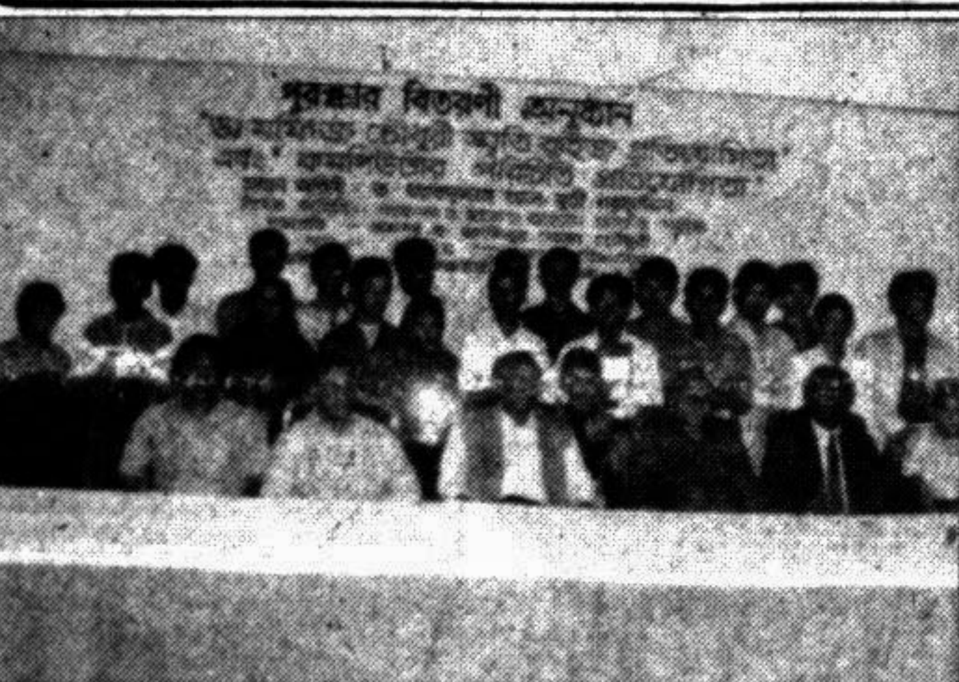
Participants at the prize-giving ceremony, of Dr Mofiz Chowdhury Quiz Competition.

Share a new feeling For protection against unplanned pregnancy and sexually transmitted disease (STD) ADCOMM/SMC/4/95