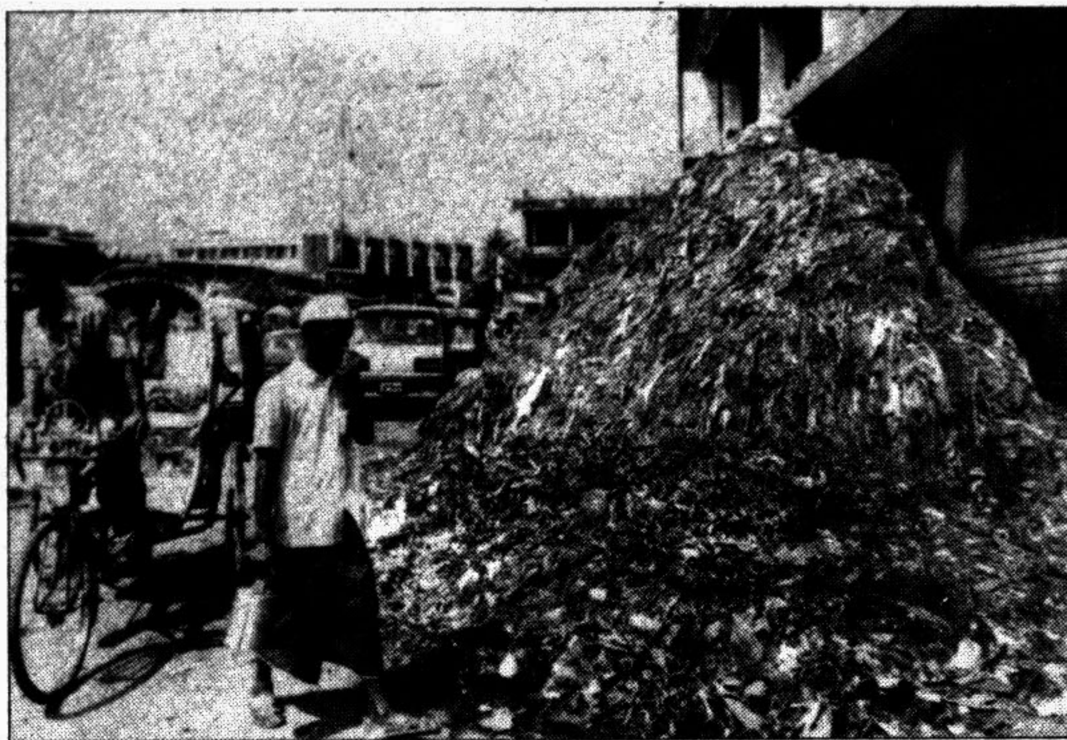
A heap of garbage near the New Supermarket adjacent to New Market puts to lie the authorities, drive to keep the city clean. This picture was taken yesterday.