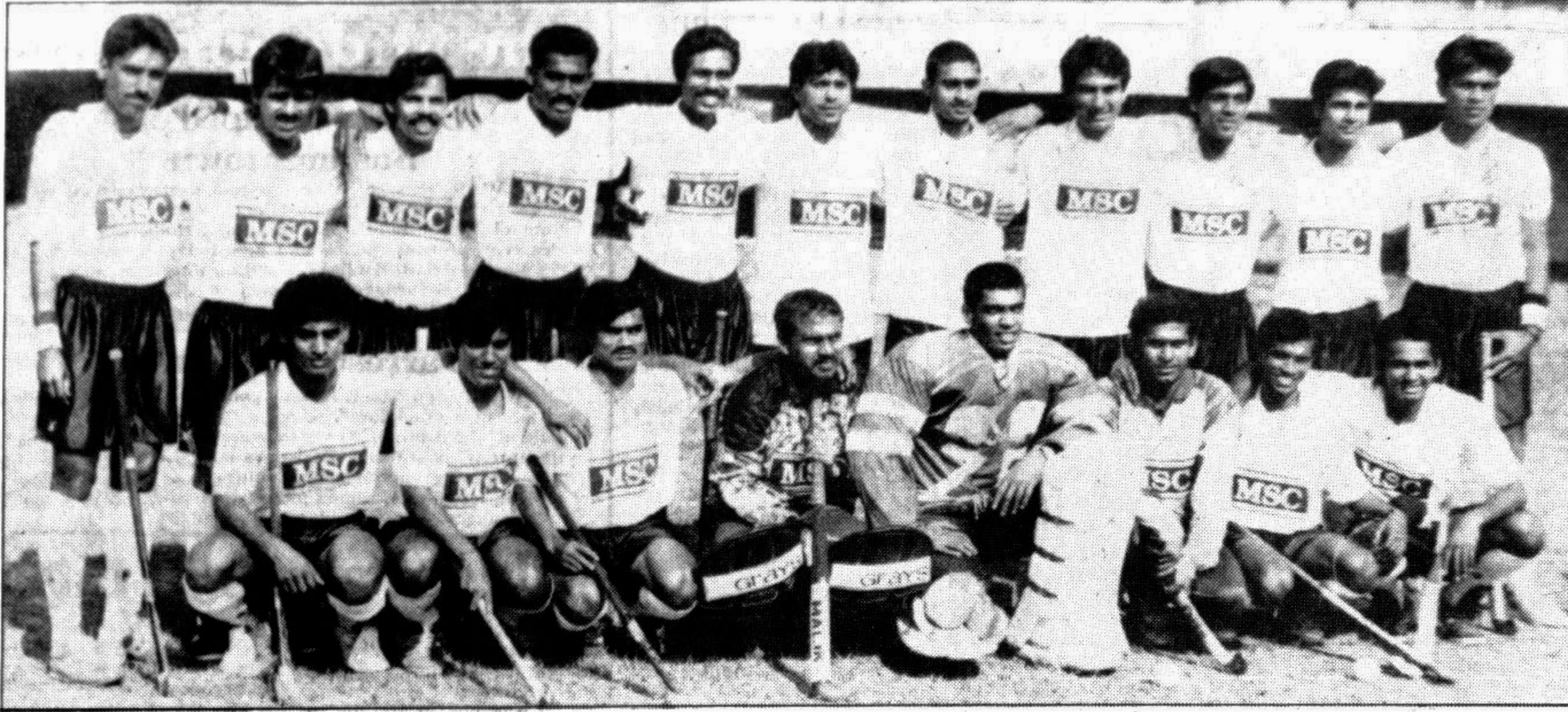
Players of the Mohammedan Sporting Club team that annexed the Green Delta Insurance First Division hockey league title yesterday.