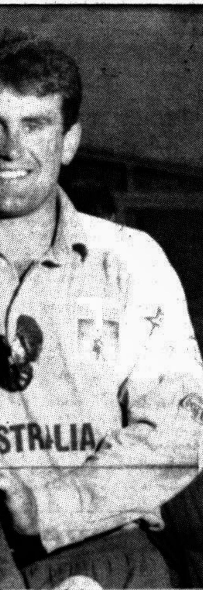
Aussie skipper Mark Taylor poses with the Centennial Trophy after beating traditional foes New Zealand in the final of the quadrangular one-day tournament at Eden Park in Auckland yesterday.