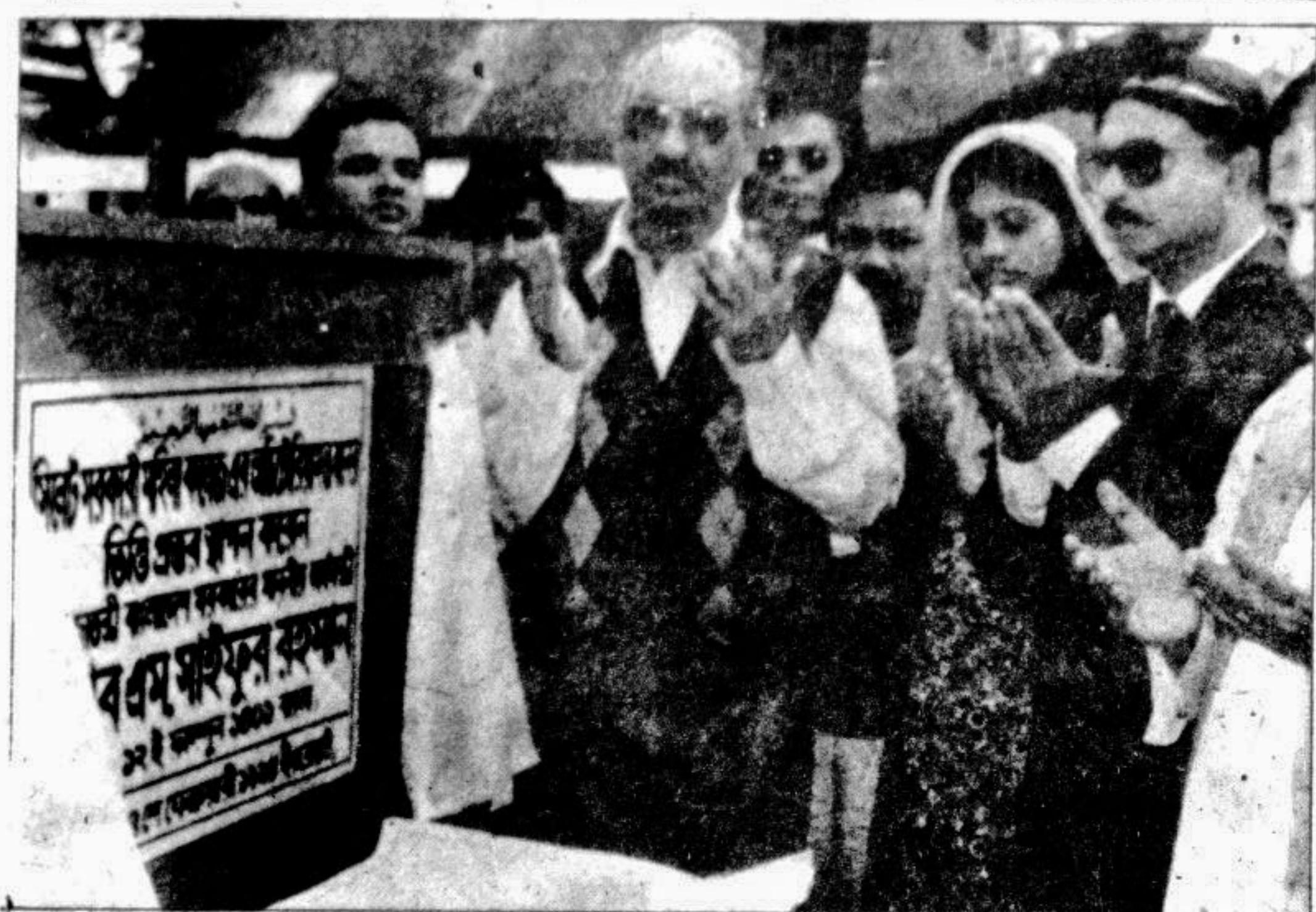
SYLHET Finance Minister M Saifur Rahman offering munajat after the laying of foundation stone of the Sylhet Government Mohila College auditorium here recently.

His namaj-e-janaza was held on the university campus and was buried at his village home.