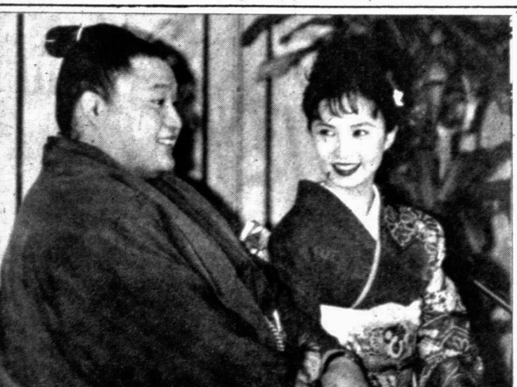
Sumo grand champion Takanohana (L), 22, gives an announcement of his engagement with Keiko Kono (R), a TV presenter eight years older than himself, during a press conference at a Tokyo hotel yesterday. Their wedding will be held on May 29.