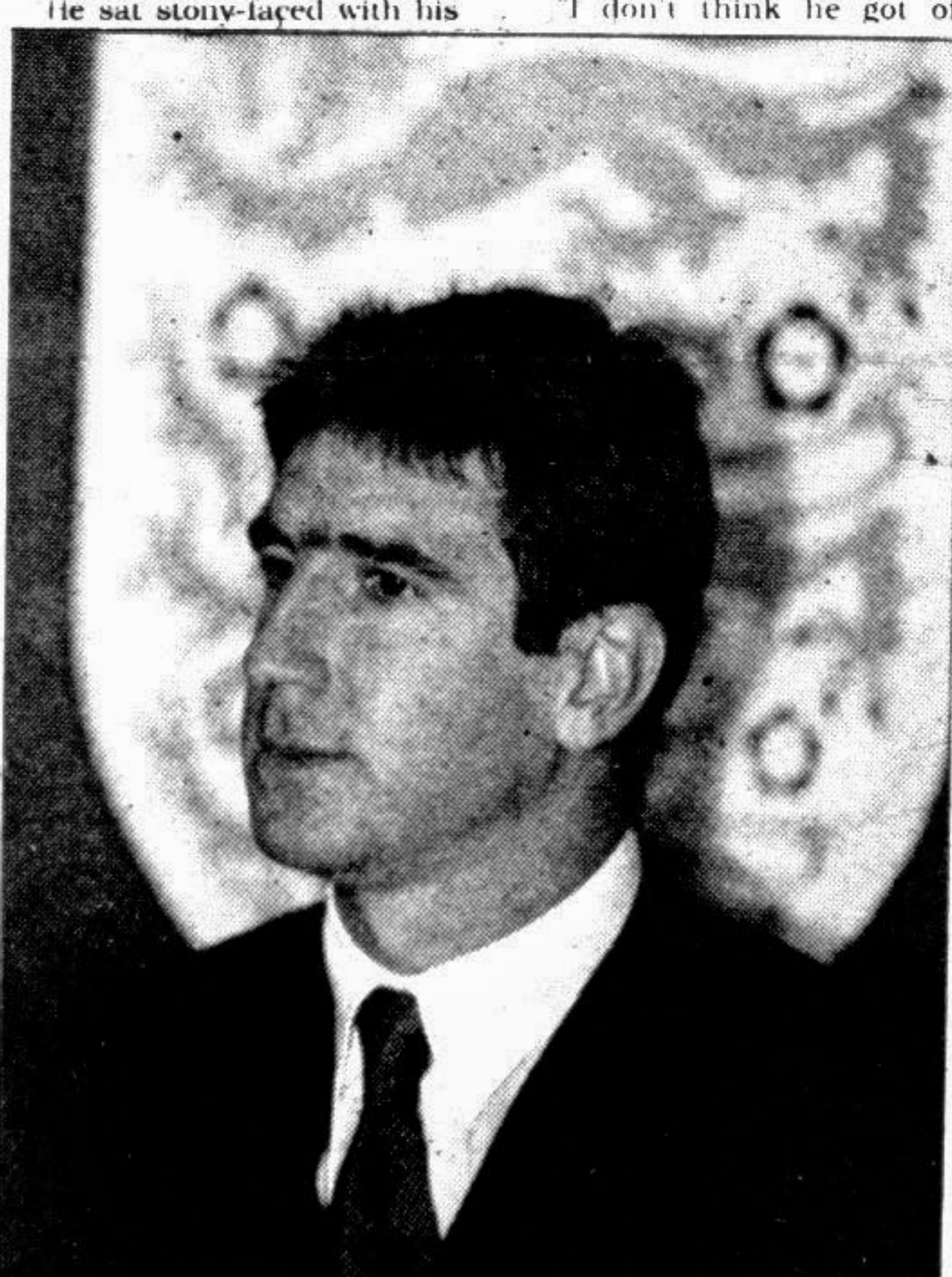
French soccer star Eric Cantona sits under the emblem of the English Football Association while attending a press conference after his hearing with the FA in a hotel on Feb. 24. Cantona received a six-month ban from playing and a ten thousand pound fine.

It stopped short of saying Graham had broken any regulations or of announcing any sanctions on the manager, sacked by Arsenal on Tuesday after they were informed of its findings.