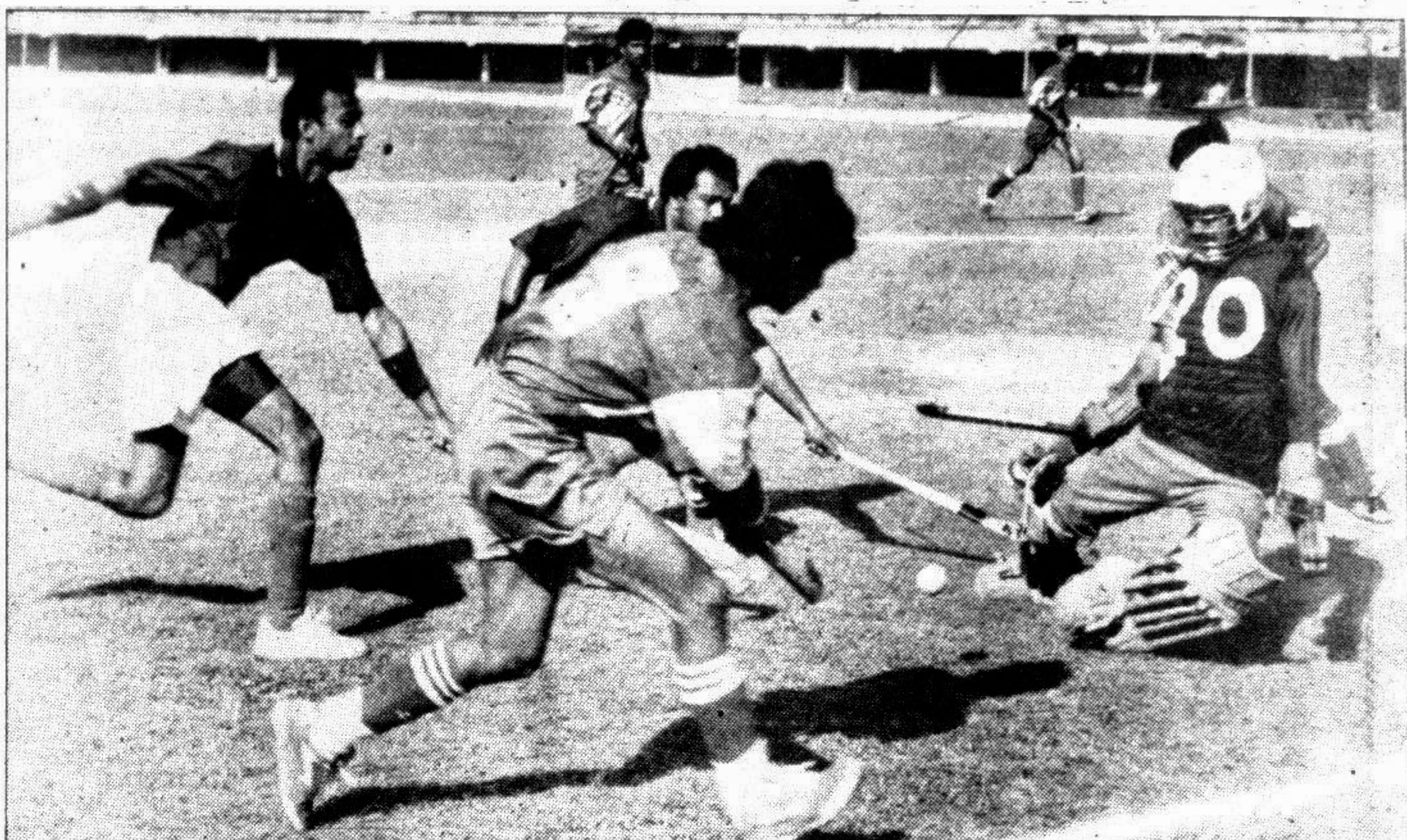
Action from yesterday's Green Delta First Division super league encounter between Usha KC and Sonali Bank at the Hockey Stadium. Usha outplayed bankers by 4-0.

Japan, South Korea and Mexico are also competing to host the event. South Korea has already submitted its bid.