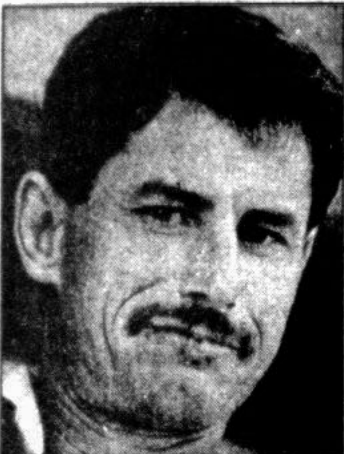
SIR RICHARD HADLEE

BOMBAY, Feb 25: Indian skipper Mohammed Azharuddin retorted angrily today to Sir Richard Hadlee's disparaging remarks about the Indian team and said "A man of his calibre should not say such things," reports PTI. Azhar, who arrived here today, was reacting to the one-