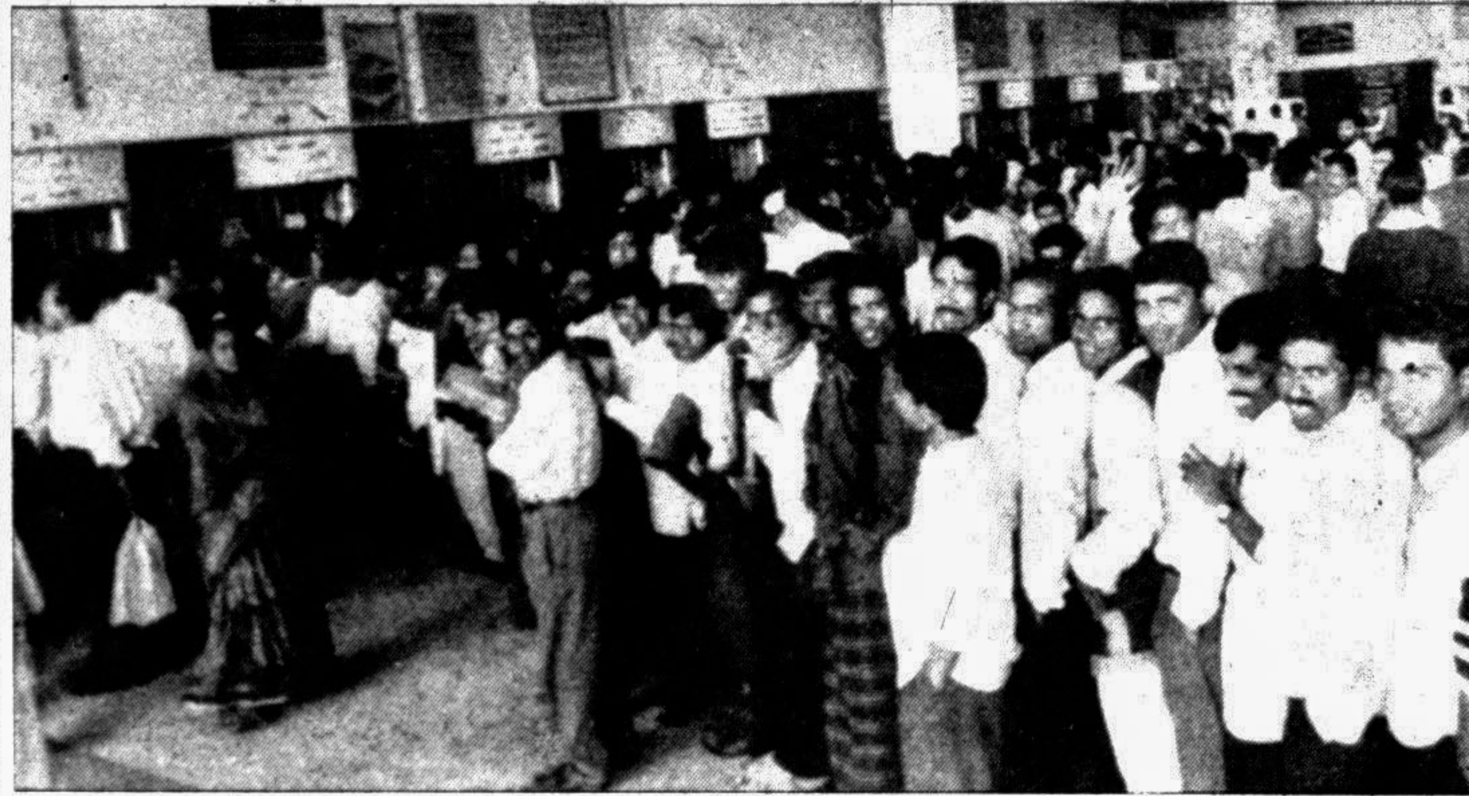
SWEET HOME : Passengers rush for advance tickets at the Kamalapur Railway Station just a week ahead of Eid yesterday.