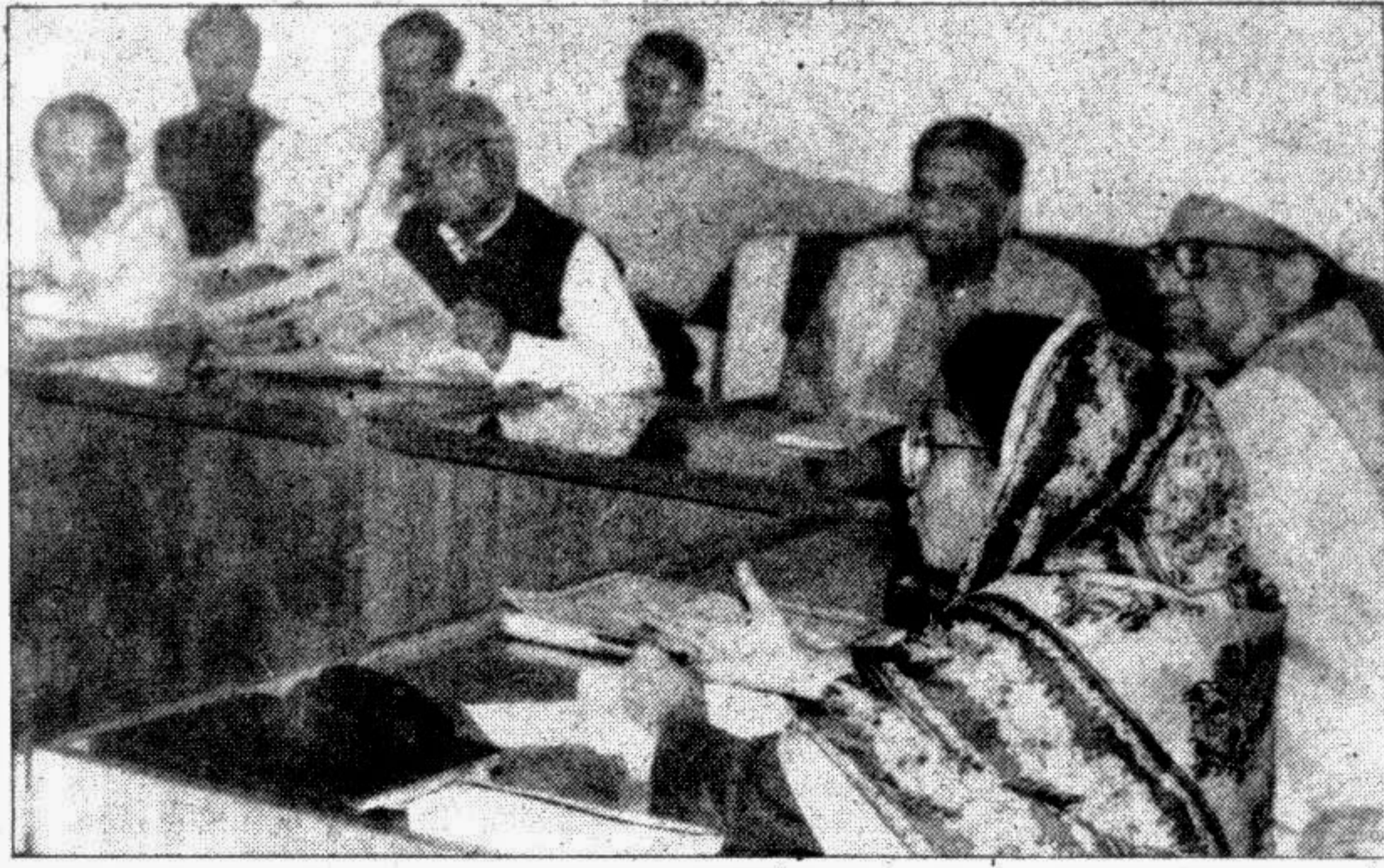
Awami League President Sheikh Hasina addressing an emergency meeting of the central working committee of the party at its Dhanmondi office in the city yesterday.