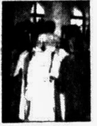
Designing Dreams Page 3