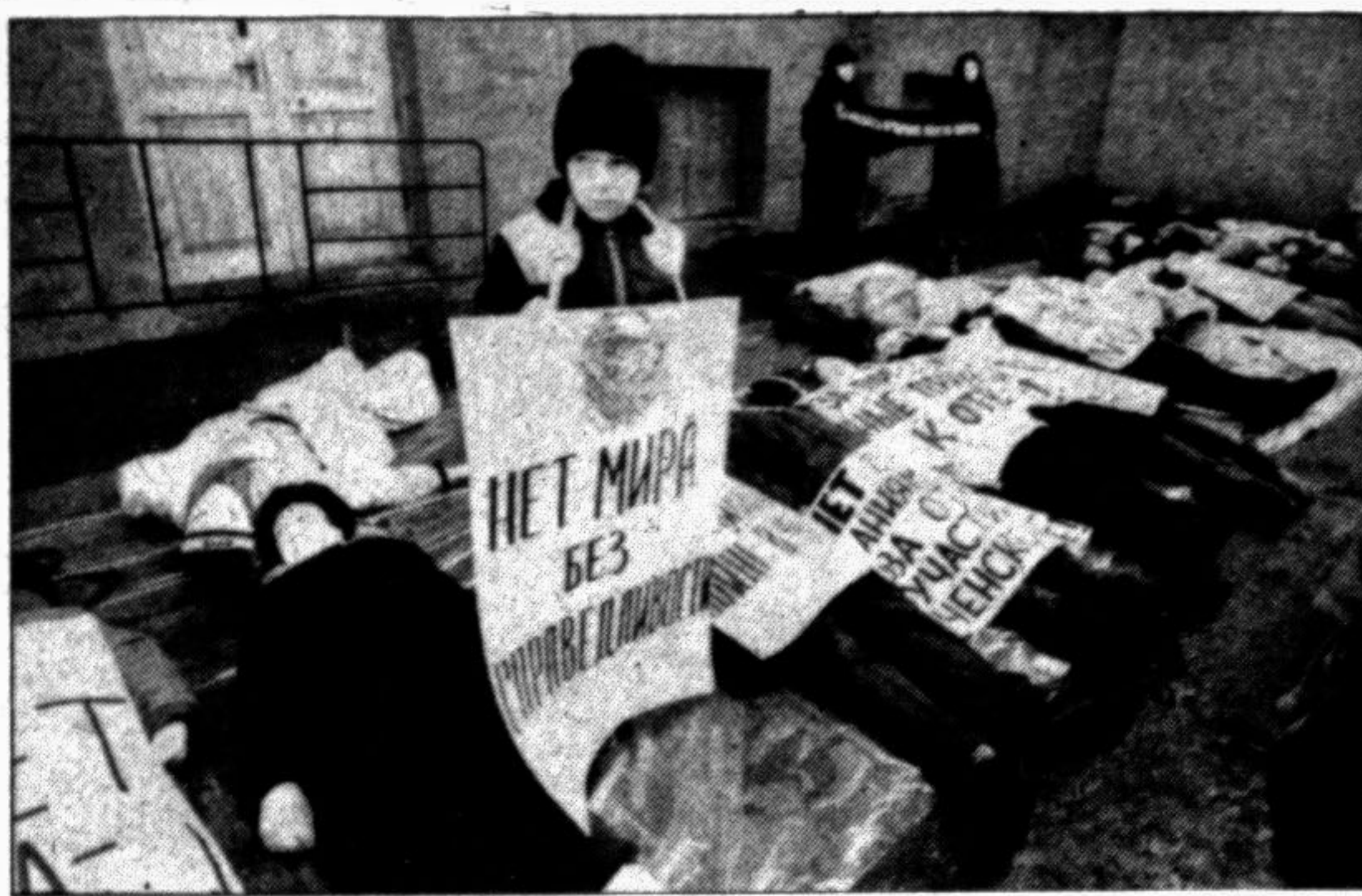
A Russian boy holding a poster that reads: "No peace without justice" stands between demonstrators lying on the ground in front of the Defence Ministry in Moscow yesterday during a protest against the war in Chechnya.