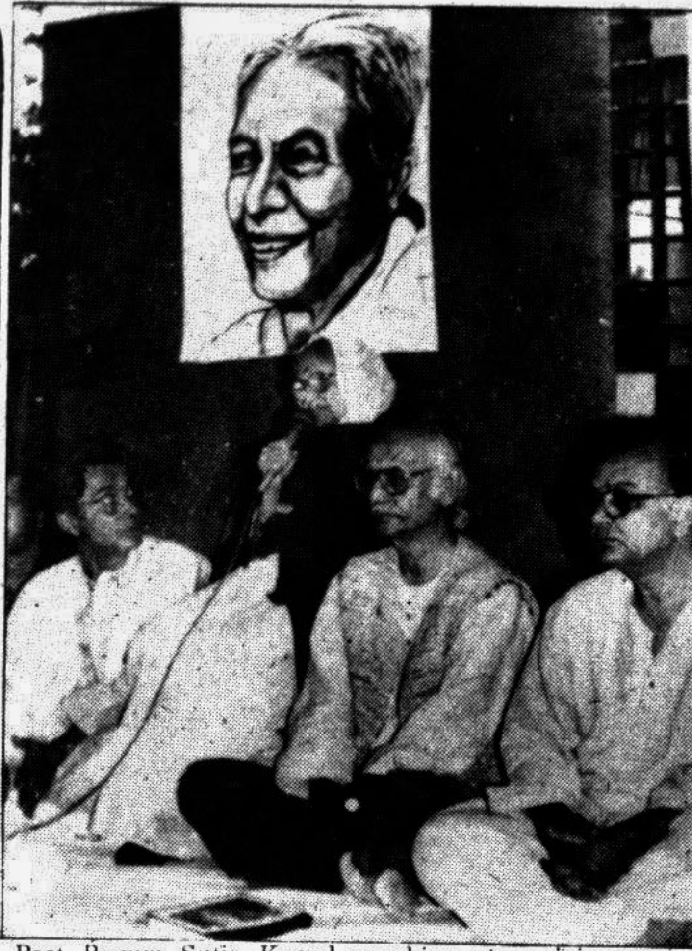
Poet Begum Sufia Kamal speaking at a civic memorial meeting on Kalpana Datta in the city yesterday.

But in spite of all this, Eid is approaching and one must go shopping. So there is no help. One must girdle one's loins and jump into the fray, the battle, the ultimate test of endurance commonly known as Eid shopping.