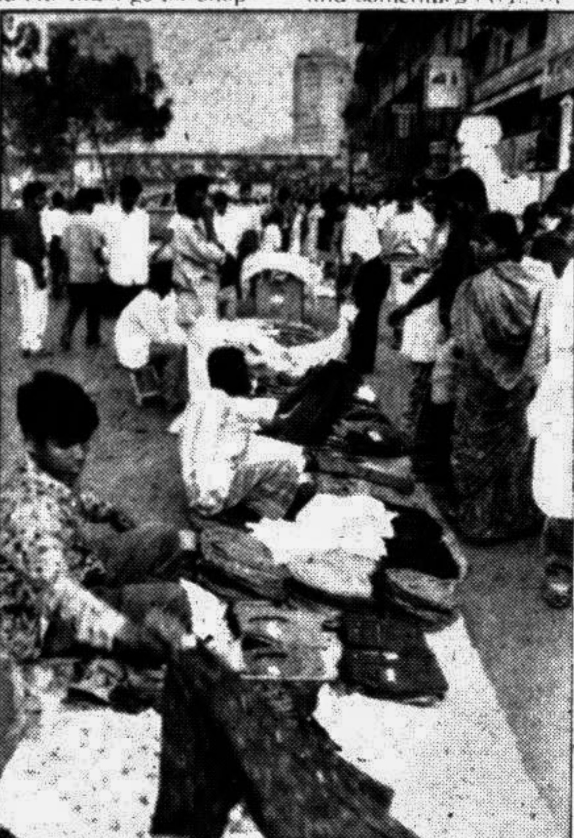
Busy Eid shopping

unknown reason during the month of Ramadan they undergo some sort of personality change like Dr Jekyll and Mr. Hyde. Instead of the charming, polite soft-spoken people they usually are throughout the rest of the year, during Ramadan they are short-tempered, argumentative and in some cases even abusive. Most probably starvation wreaths their wits on their temper.