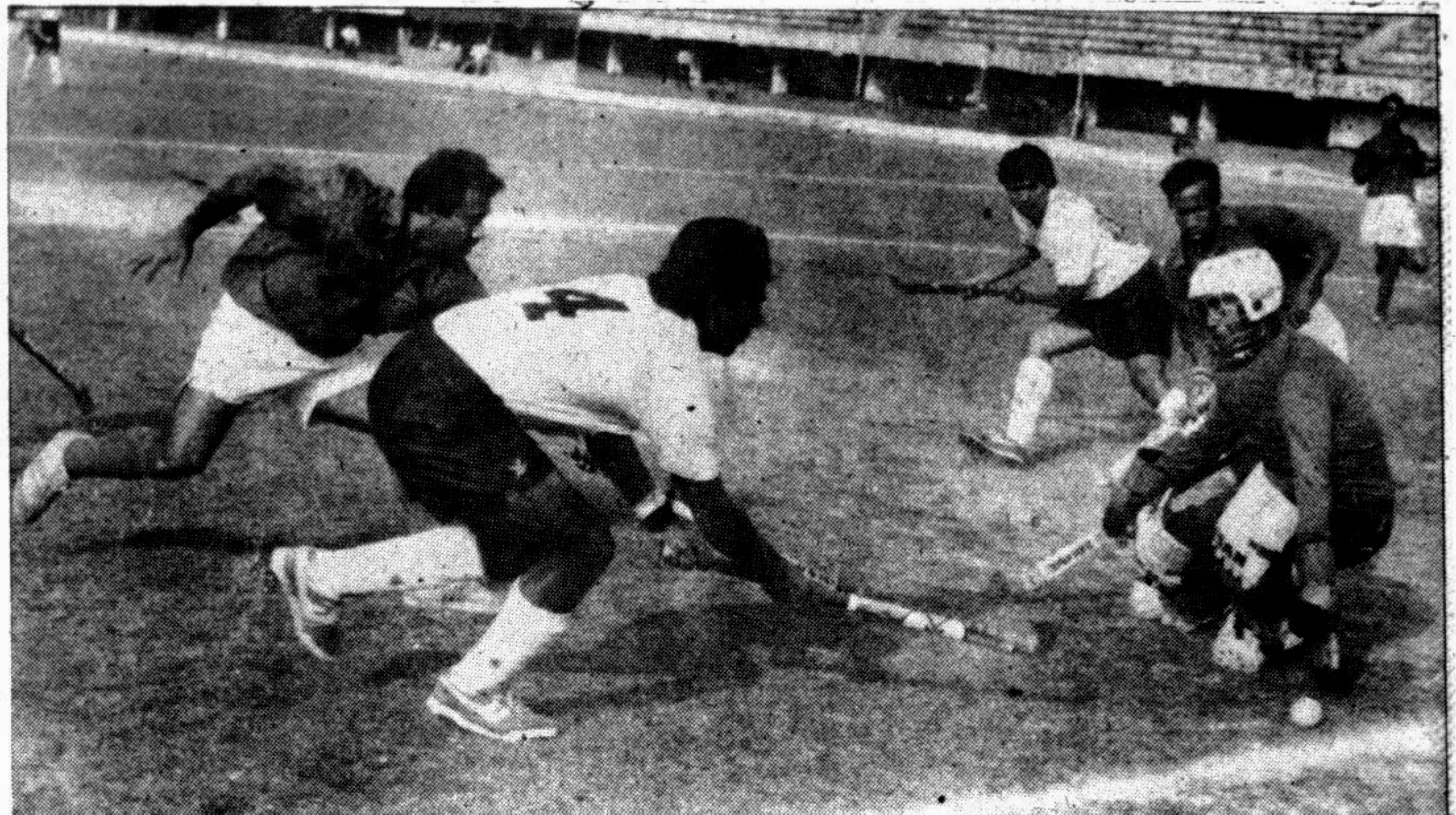
A goalmouth melee in the Green Delta First Division super league match between Mohammedan Sporting Club and Sonali Bank at the Hockey Stadium yesterday. MSC went on a scoring-spree netting nine times without reply.

South Korea can also point to the successful staging of the 1988 Olympic Games, although Japan was the first Asian country to stage the Olympics in Tokyo in 1964.