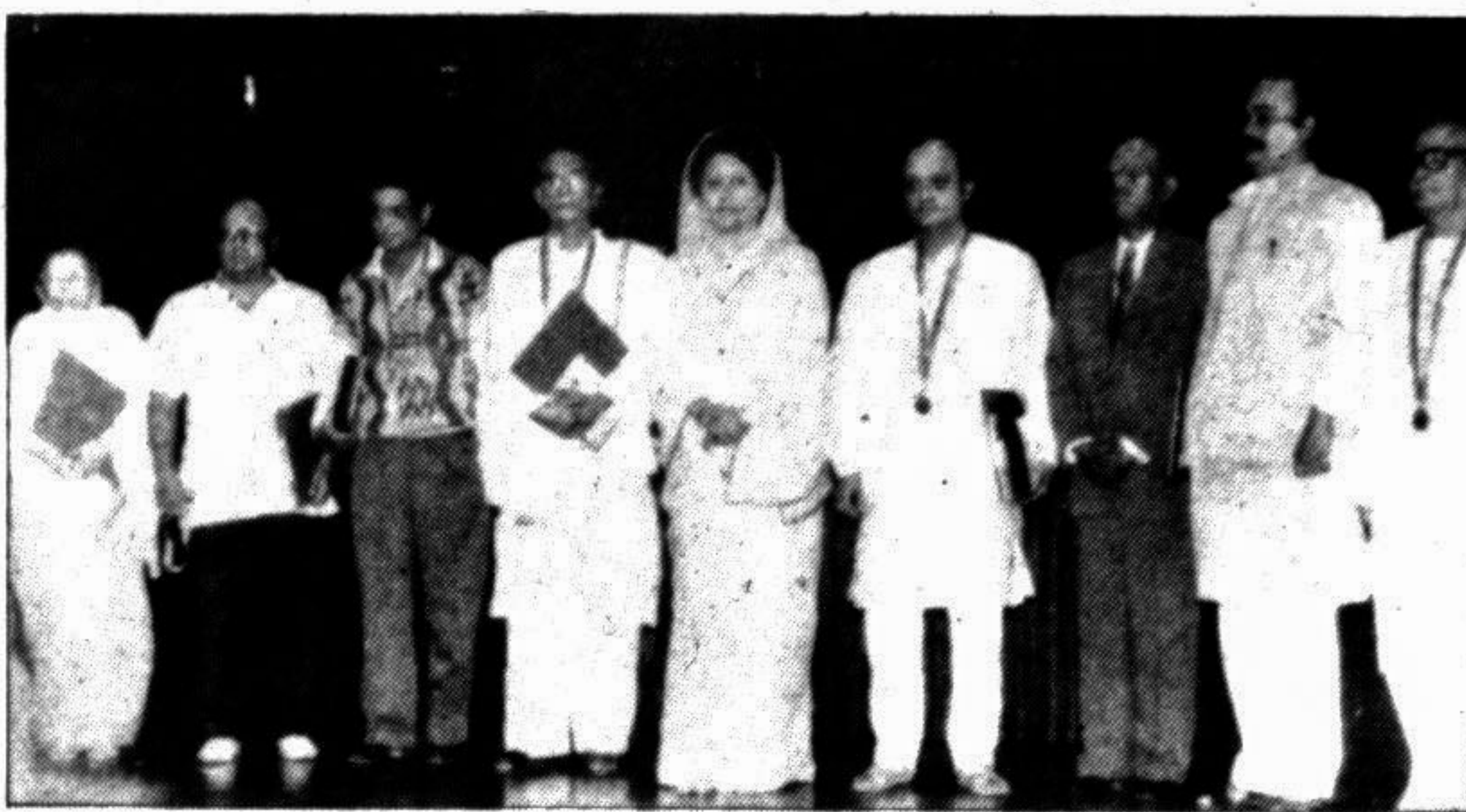
Prime Minister Begum Khaleda Zia with the recipients of the 'Ekushey Padak' for 1994 at the Osmany Memorial Hall in the city yesterday.