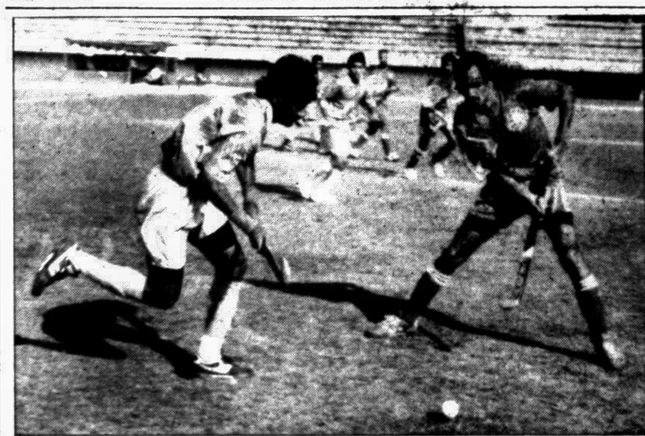
Mid-pitch action from yesterday's Green Delta First Division super league encounter between holders Abahani Krira Chakra and Usha KC at the Hockey Stadium. Abahani won 1-0.

Privalova, the European outdoor 100 and 200 metres champion, equalled her own world indoor 60 metres record this month while Johnson ended the 44-race unbeaten streak of Britain's world high hurdles champion Colin Jackson in Madrid on February 9.