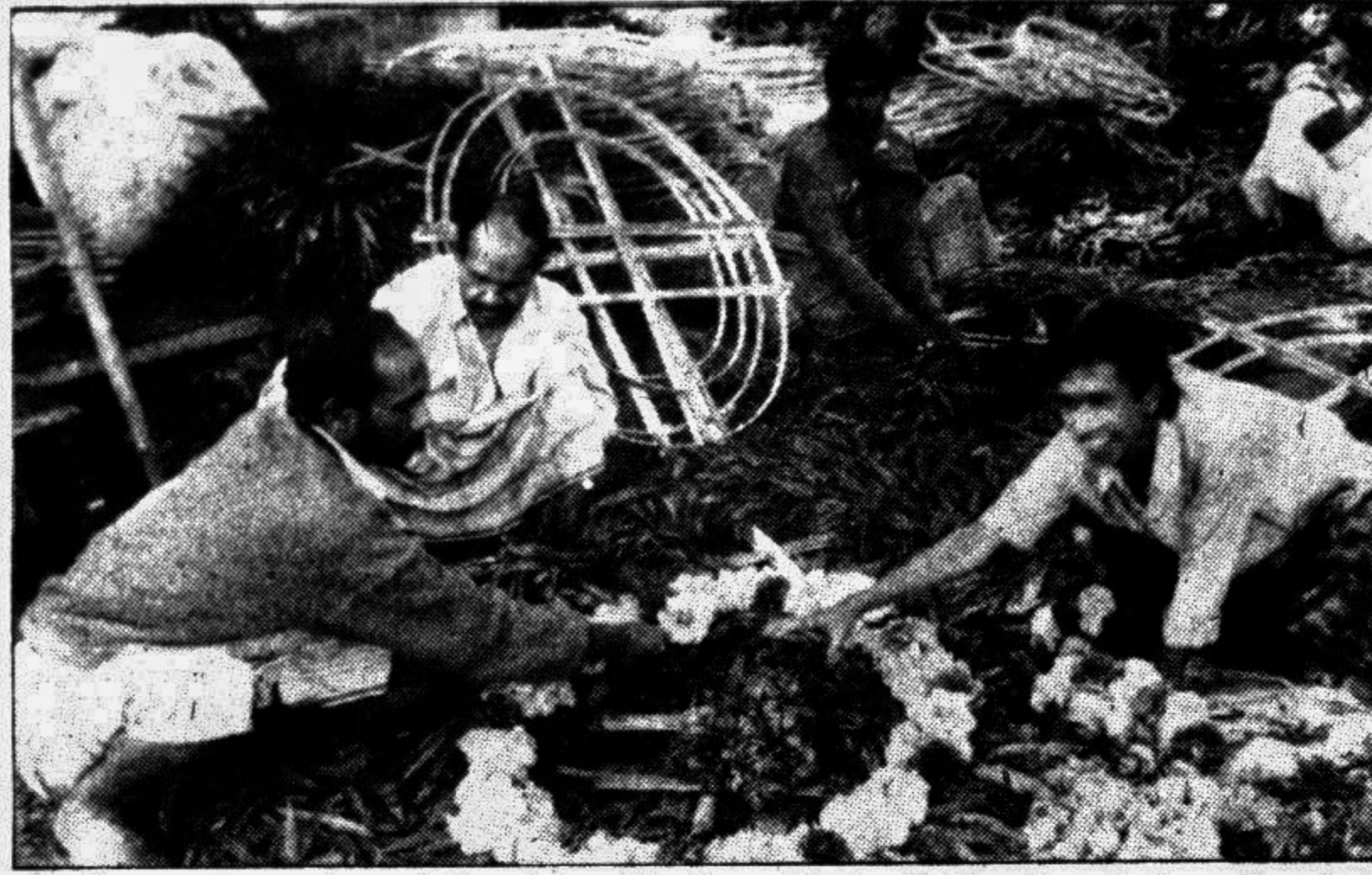
Florists making wreaths with the advent of the 'Amar Ekushey' in the city yesterday.

The reason for his belief is that he feels that Bengalees as a nation is very flexible and tolerant. "They accept things as they come and are not rigid. One who celebrates valentine's day, goes to Shaheed Minar on February 21, prays in the mosque on Fridays, exchanges cards on new years. The younger generation are more open and agreeable. I still have hope as long as they remain so. This transitional period is only a dot if compared to good things ahead."