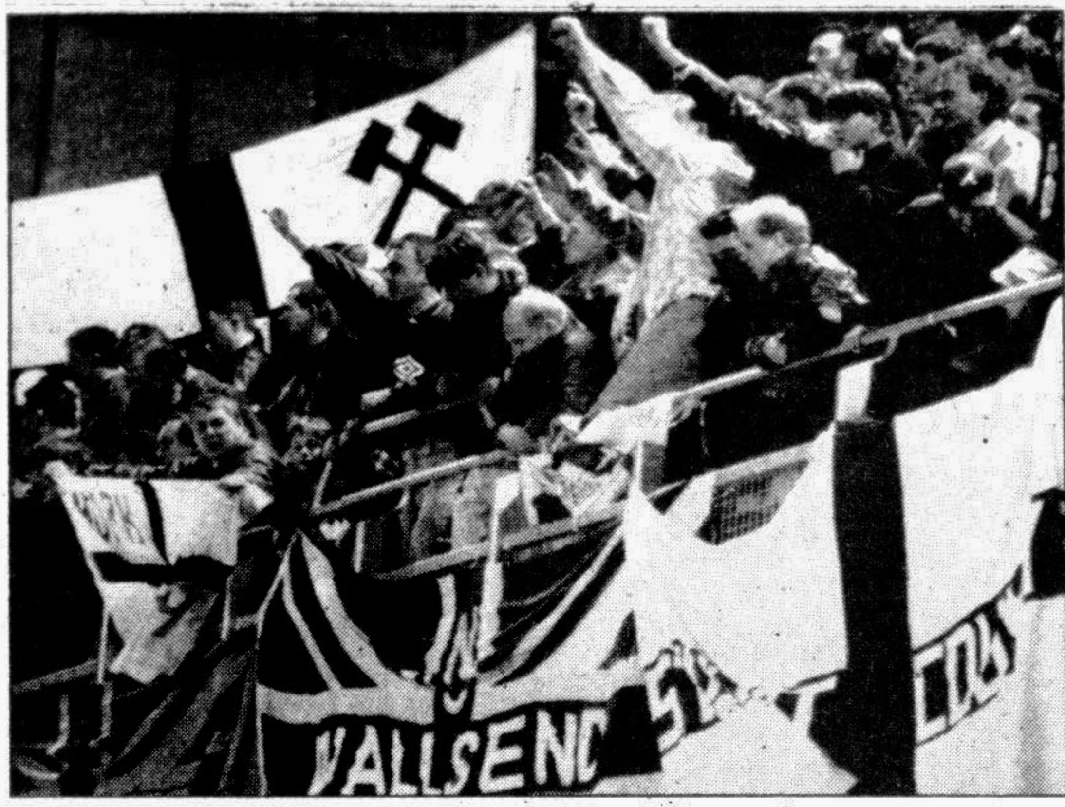
English fans begin to chant during the friendly match against the Republic of Ireland at Lansdowne Road in Dublin on Feb 15. The match had to be abandoned after rioting broke out with Ireland leading 1-0 at the time.

India play South Africa in the next match of the quad-rangular centenary series in Hamilton on Saturday.