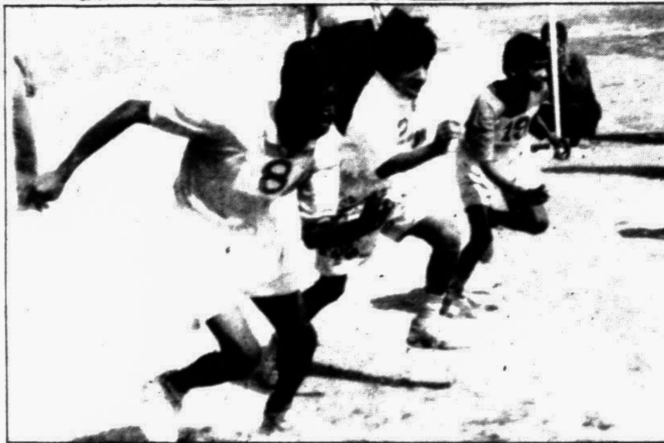
Mentally retarded participants at the national games of Special Olympics Bangladesh held at the Dhaka University playground yesterday.

A sports team, selected from these games, will take part in the Special Olympics to be held in the United States in July this year.