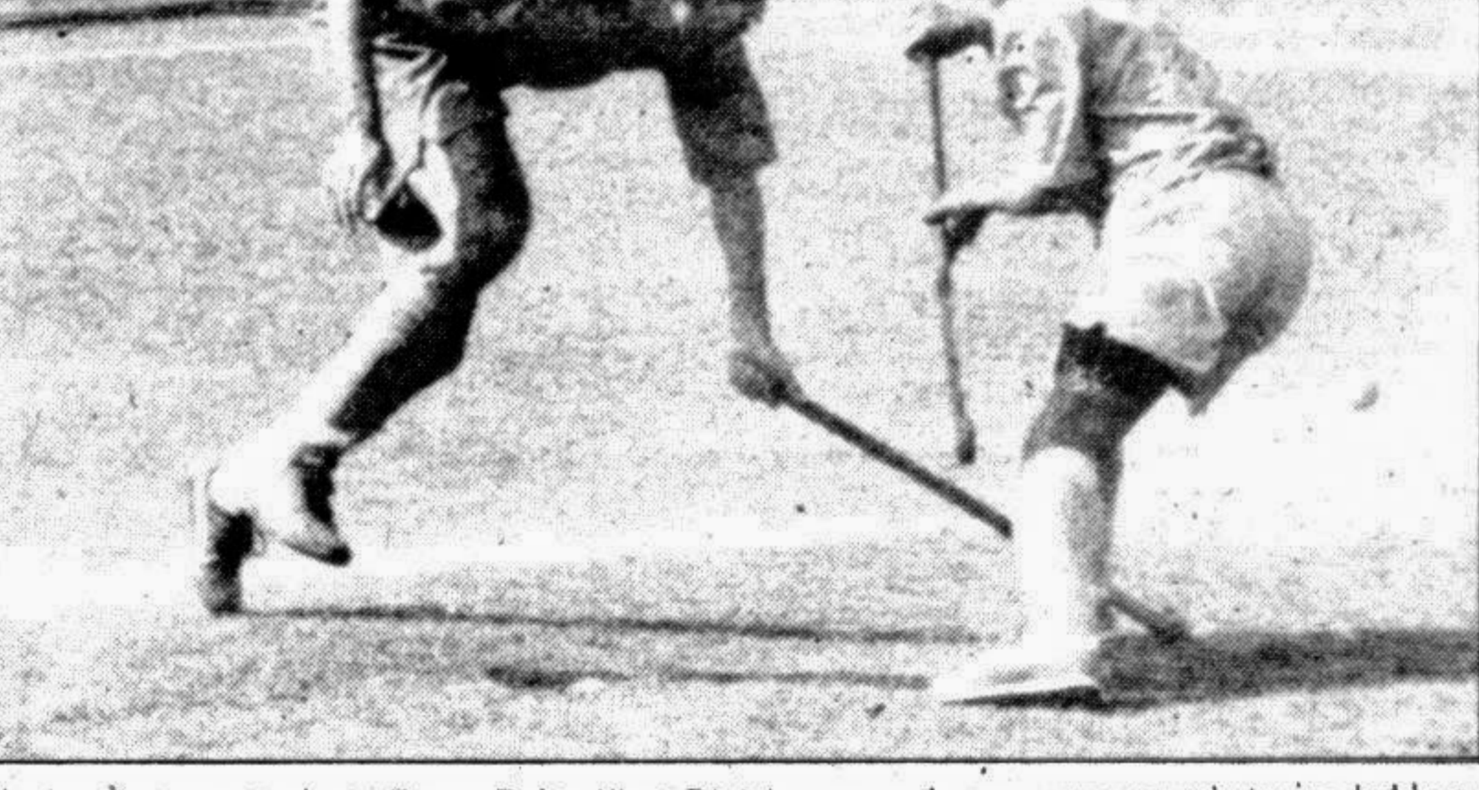
Action from yesterday's Green Delta First Division super league encounter between holders Abahani Krira Chakra and Mariner Youngs at the Hockey Stadium. Abahani won 2-1.