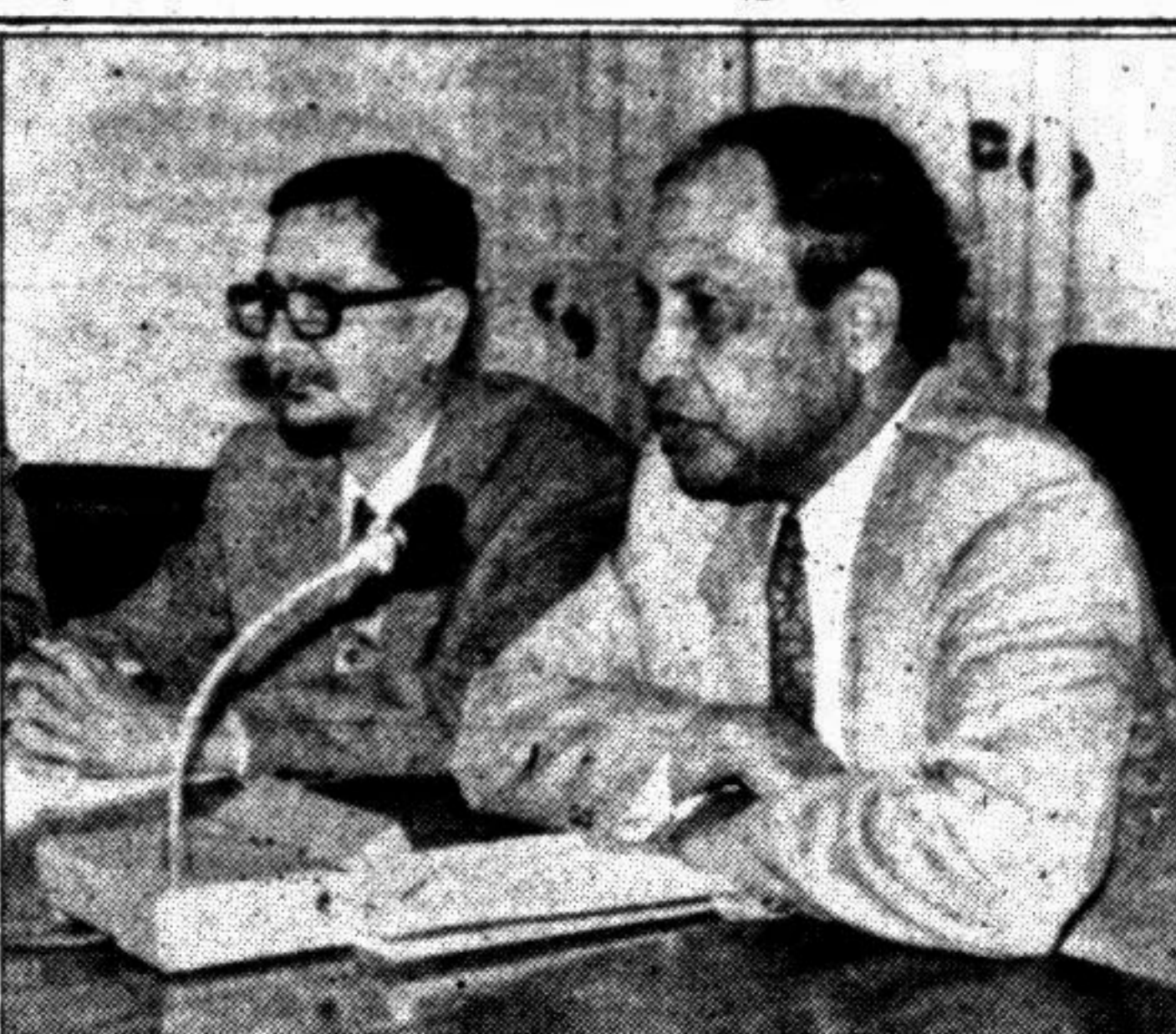
State Minister for Civil Aviation and Tourism Major (Retd) Abdul Mannan addressing a press conference at the Biman head office yesterday.