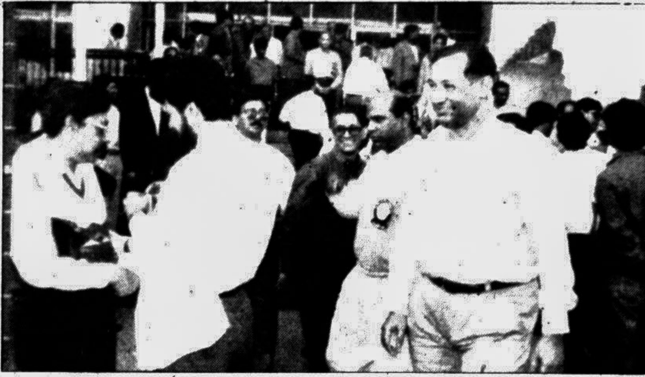
Voters are seen gathering during the elections for one-third posts of the BGMEA at its Secretariat at Kawranbazar in the city yesterday.

BENAPOLE (Jessore), Feb 16: The land port of Benapole has earned revenue worth Tk 2.66 crore during the first six months of the current fiscal year by handling 2.39 lakh metric tons of imported and exported goods, says UNB.