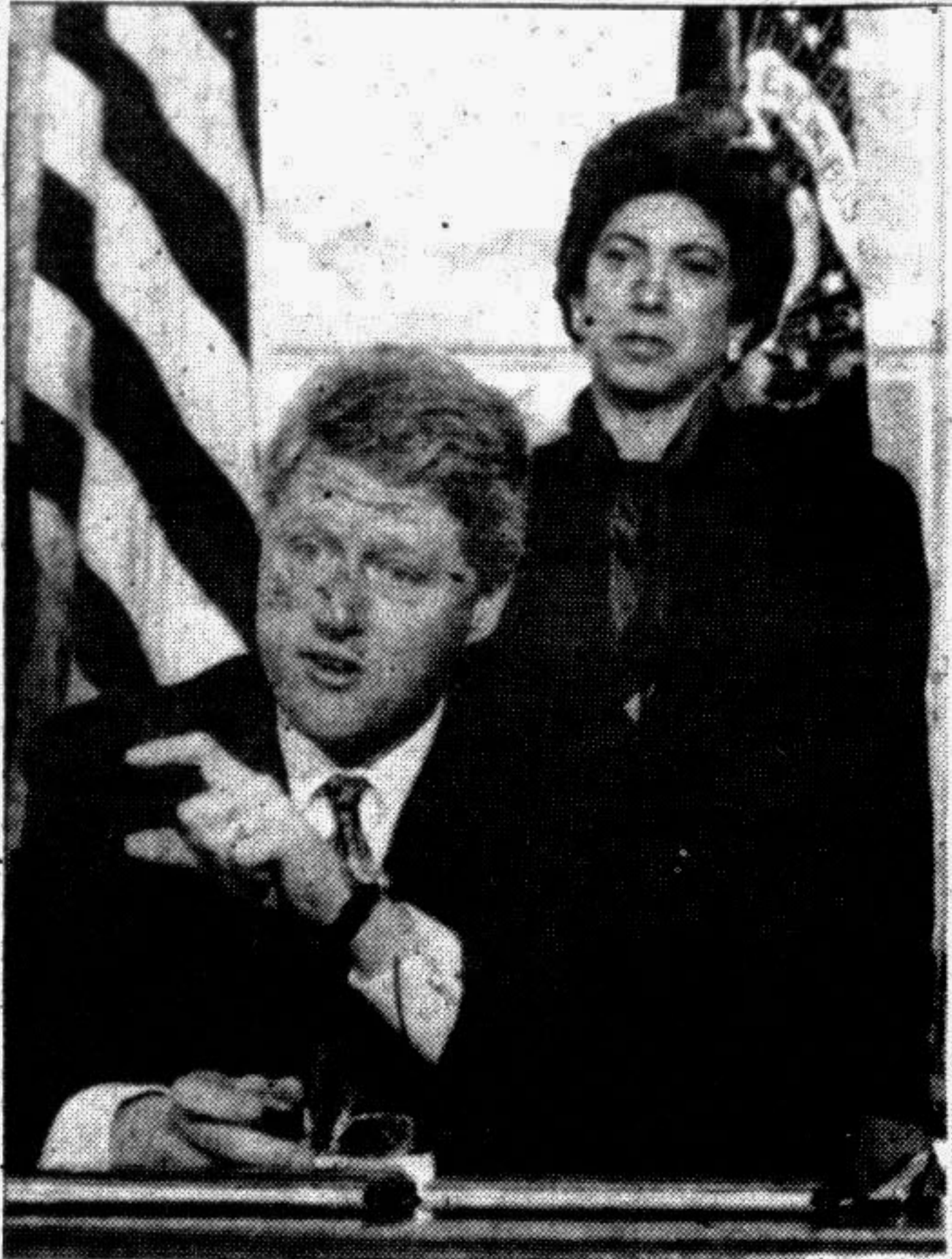
US President Bill Clinton (L) talks to reporters as his chief economic adviser Laura Tyson looks on at the White House in Washington on Monday. Clinton sent his annual economic report to the US Congress earlier Monday and said that America's economic prospects have improved considerably in the last two years and will continue to improve through 1996.