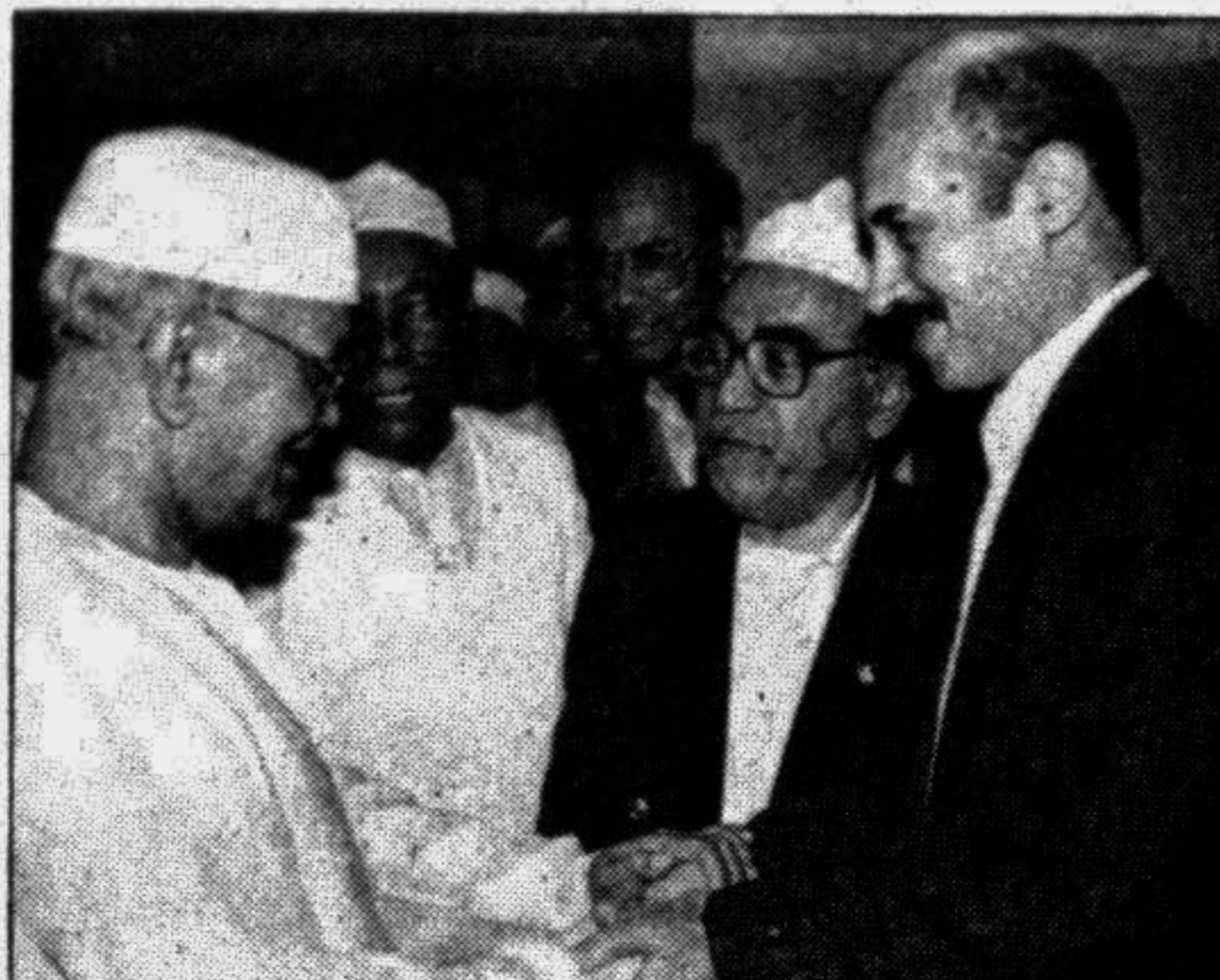
President Abdur Rahman Biswas hosted an iftar party for the editors, journalists and ulema at the Bangabhaban yesterday.