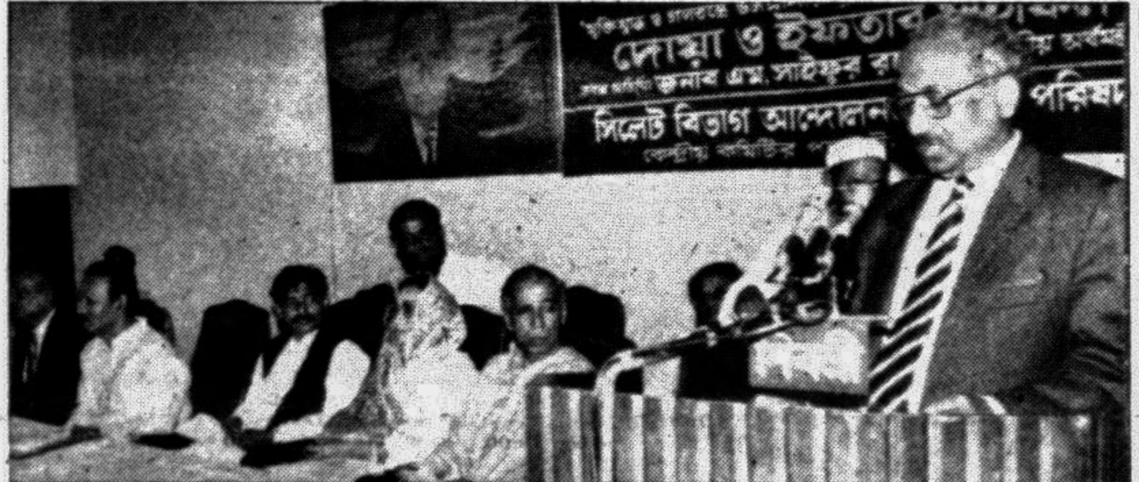
Finance Minister M Saifur Rahman speaking as a chief guest at a discussion and doa mahfil in memory of General MAG Osmany at the Jatiya Press Club auditorium in the city yesterday.

He was addressing the inaugural function of DCC UCEP school at Ganoktuli Cleaners' Colony in Hazaribagh.