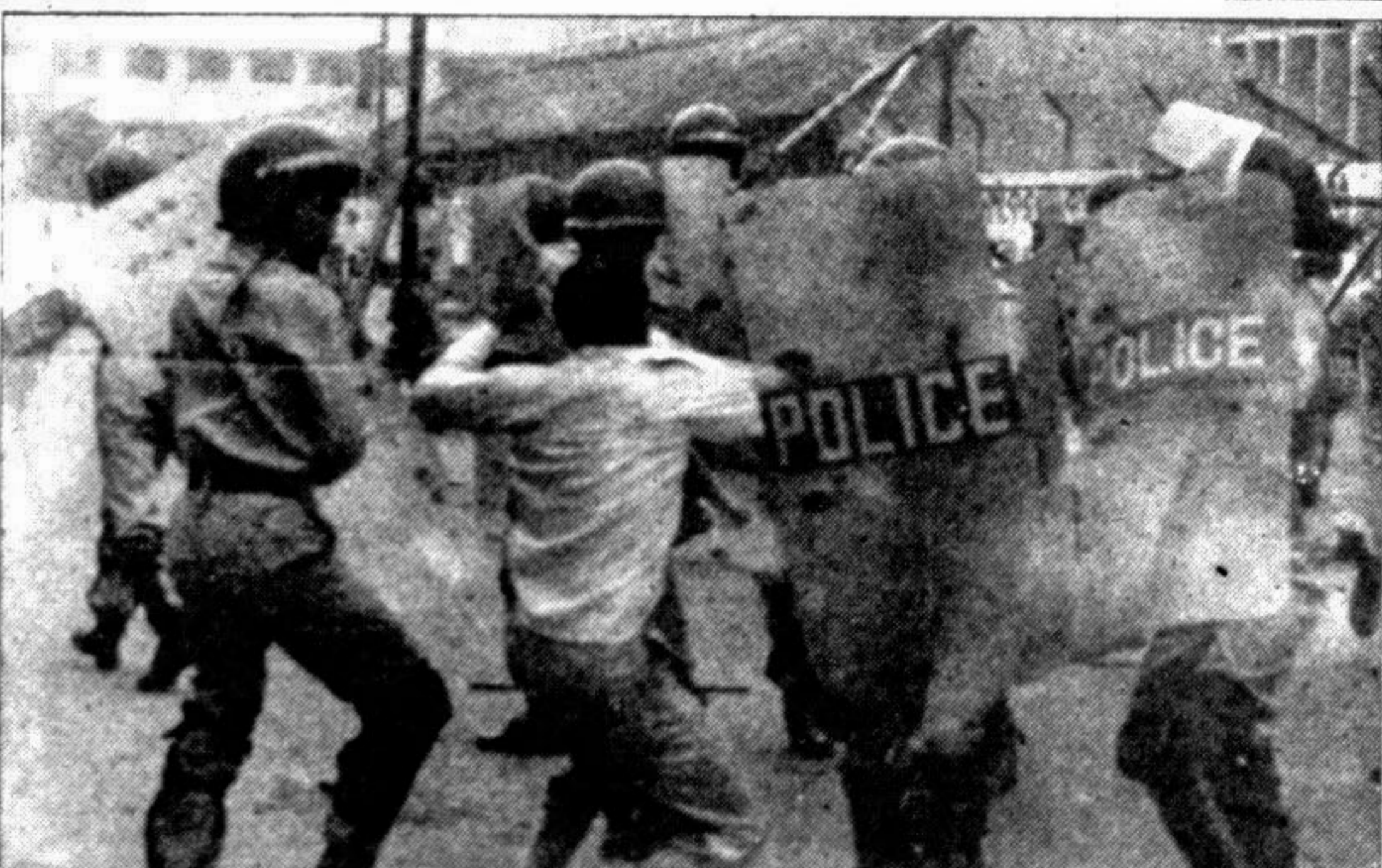
Yet another target of policemen's wrath at Tophkhana Road in the city during a half-day hartal called by the Left Democratic Front.

A PID handout yesterday said that the application for DV-96 visa should reach the US immigration authority within March 1 next. Applications reaching the US immigration authority after March 1 will be considered disqualified.