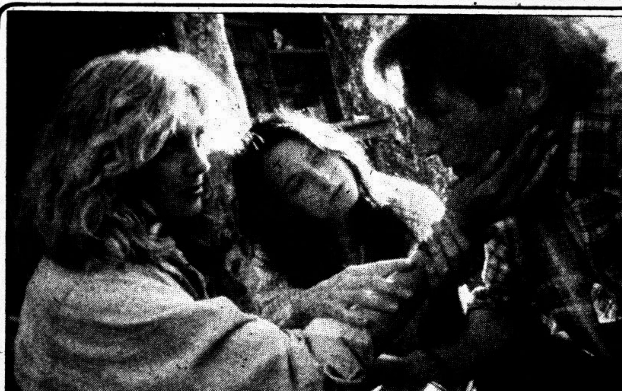
Actress Jodie Foster (C) as "Nell" in a scene with actor Liam Neeson (R) and Miranda Richardson from the movie "Nell." Foster was nominated Tuesday for an Academy Award for best performance by an actress for her title role in the movie. Richardson was also nominated for best performance for an actress for her role in "Tom & Viv."

Different political parties and socio-cultural organisa-