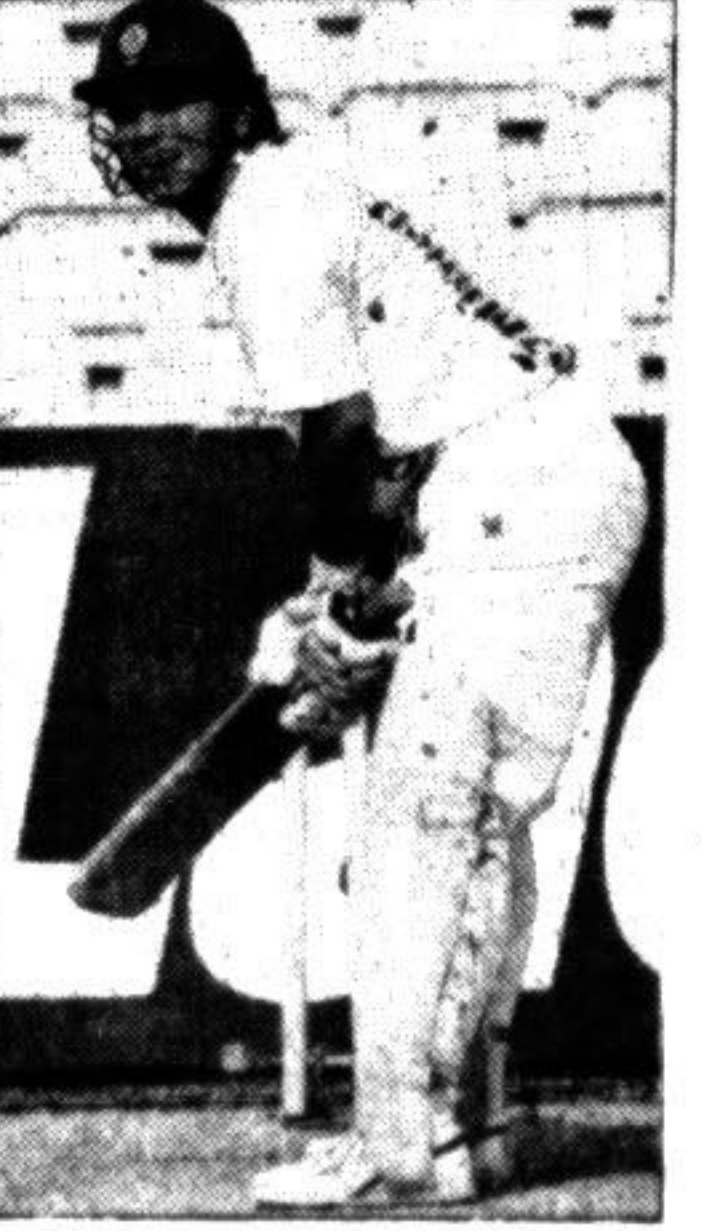
TENDULKAR ... 139 n.c