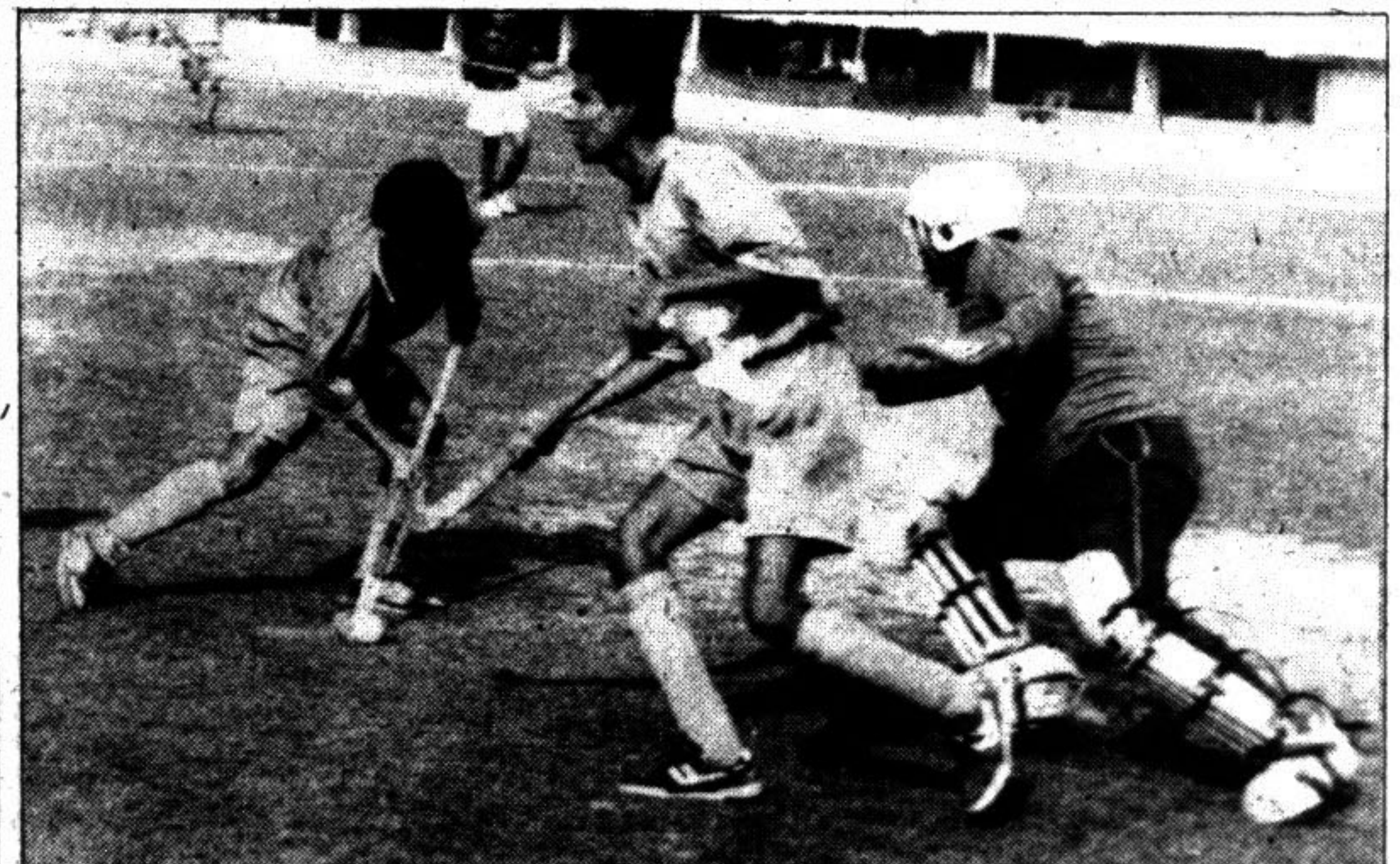
A goalmouth melee during yesterday's Green Delta Insurance First Division super league match between title aspirants Mariner Young's Club and Sonali Bank at the Hockey Stadium.