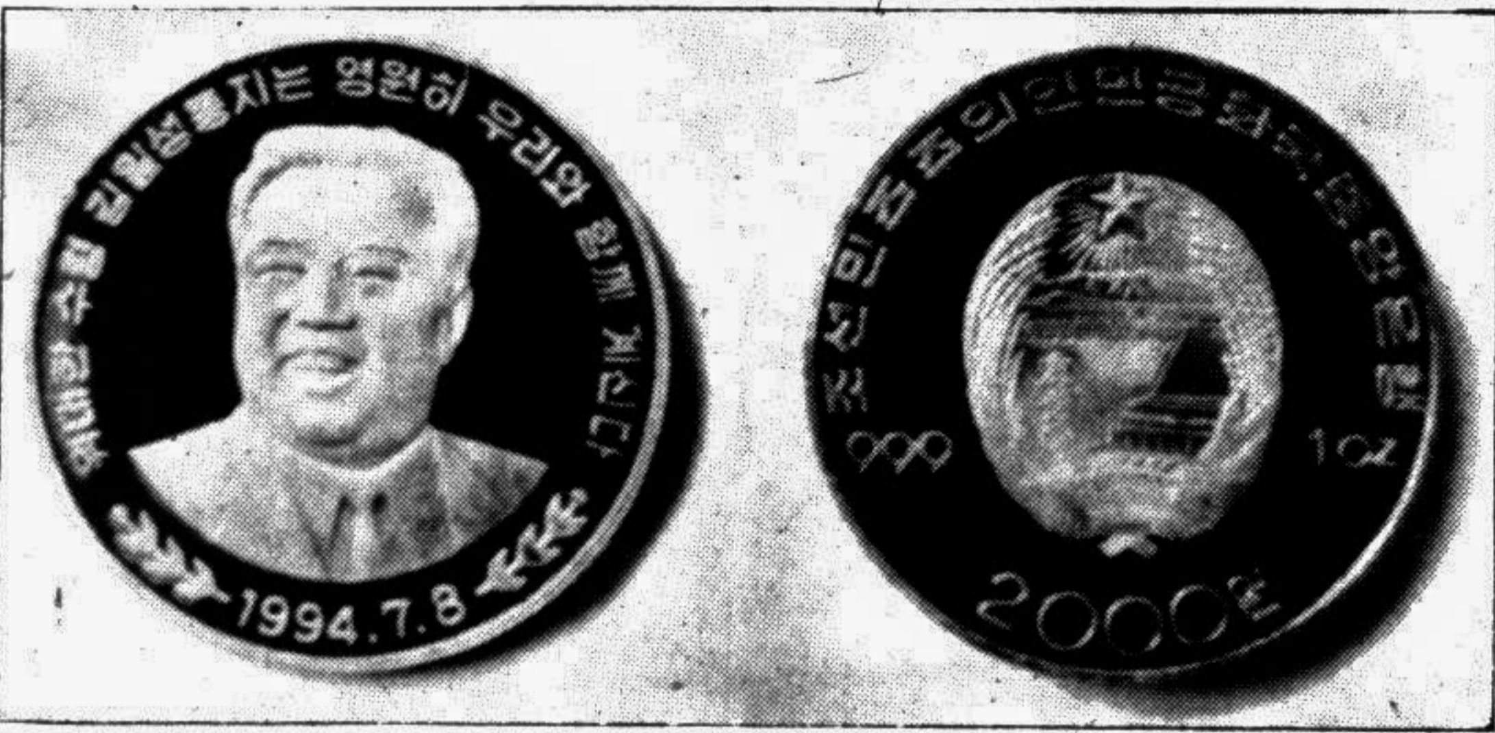
This photo released Sunday by the official North Korean News Agency (KCNA) shows a memorial gold coin sporting a likeness of late DPRK leader Kim Il Sung issued by North Korea on Saturday.

Preston, 68, is widely expected to retire soon, the paper said. The principal contenders are Lawrence Summers, Under Secretary of the Treasury for International Affairs and a former chief economist at the World Bank.