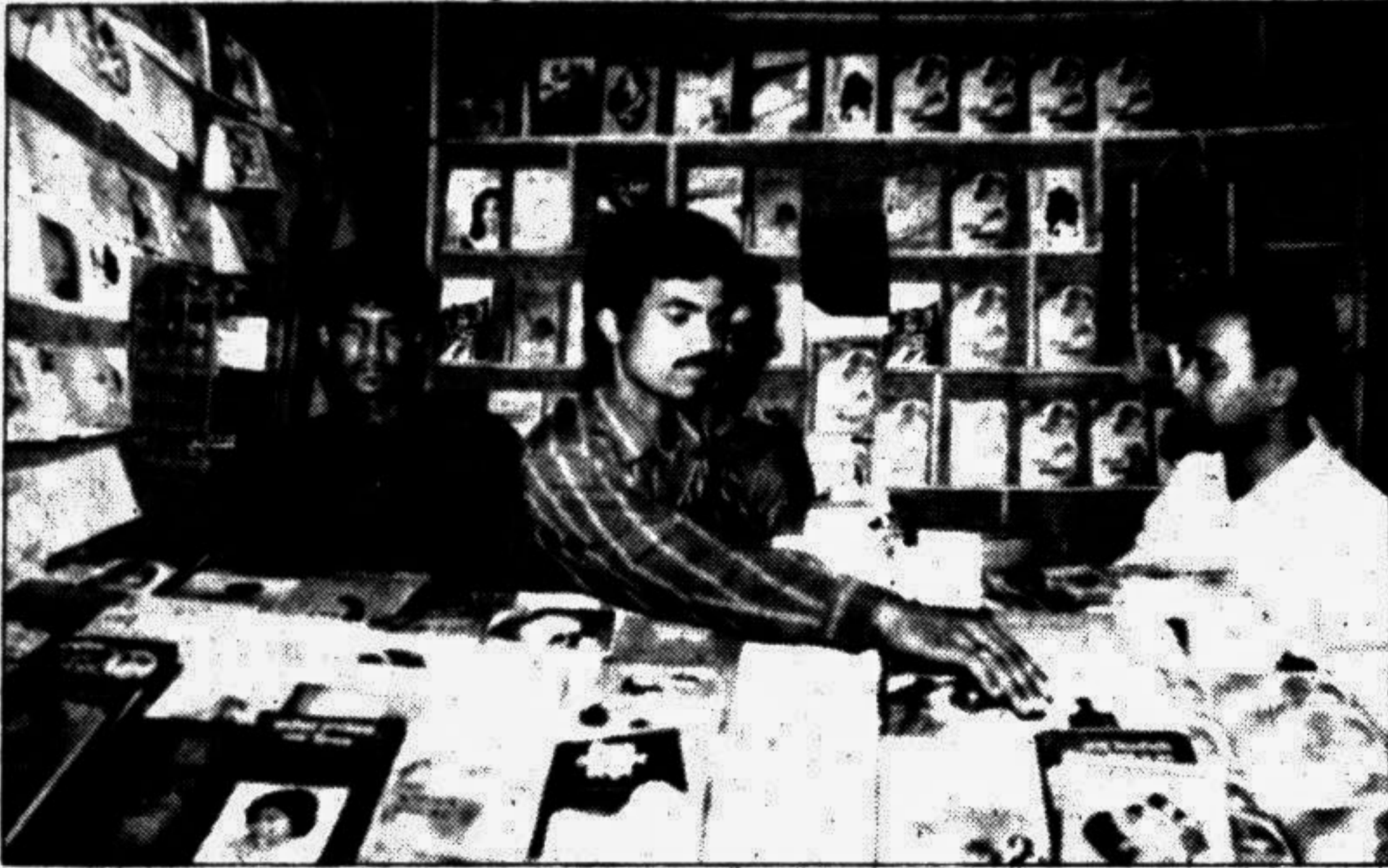
The youths have a better way with books.