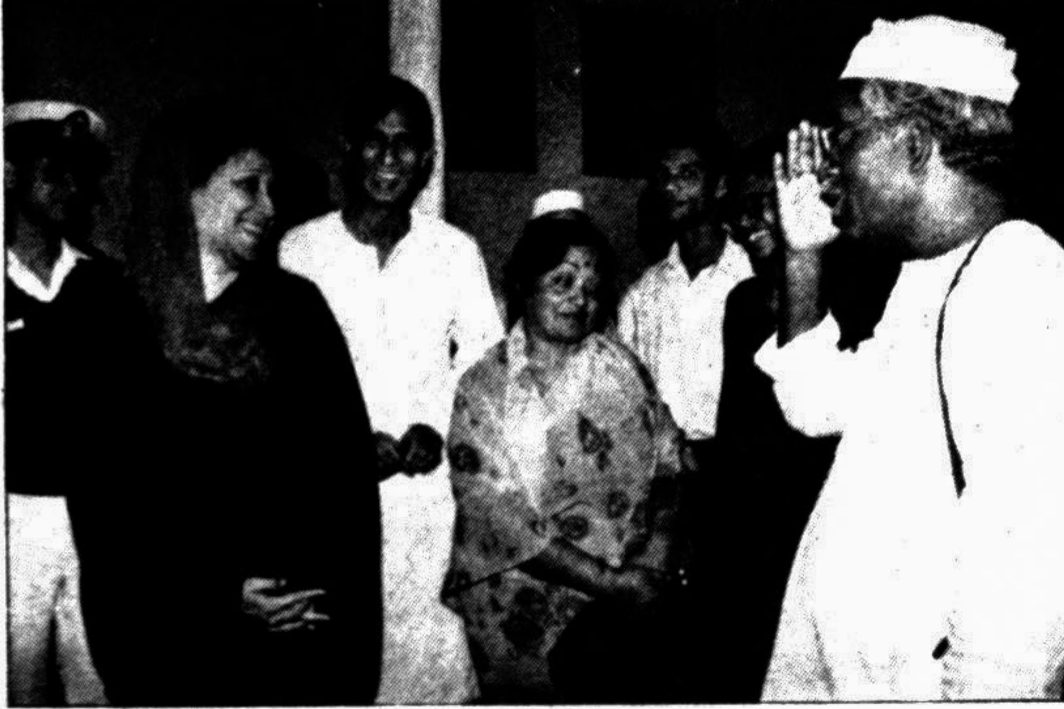
Prime Minister Begum Khaleda Zia exchanging pleasantries with invitees to an Iftar party she hosted at her 30, Hare Road official residence yesterday evening