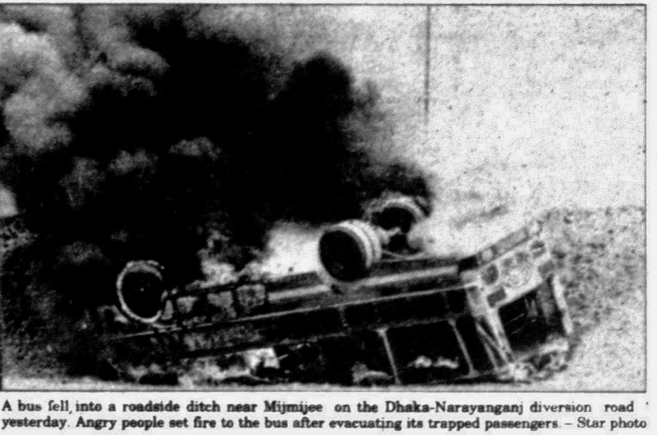
A bus fell into a roadside ditch near Mijmijee on the Dhaka-Narayanganj diversion road yesterday. Angry people set fire to the bus after evacuating its trapped passengers.

By Reaz Ahmad A special immunization drive to eradicate polio from the country and elevate immunization coverage of six antigens of the Expanded Programme on Immunization (EPI) to 80 per cent starts off from mid-March. According to the Health Ministry sources, all children of the country under 5 years of age, accounting for 16 per cent of the total population, will come under this special month-long drive styled the 'EPI National Immunization Day (NID)', which will begin on March 16 throughout the country. Governments of the states attending the 1990 World Summit for Children had fixed a mid-decade goal — immunization against the six major vaccine-preventable diseases of childhood to reach at least 80 per cent in all countries and elimination of polio in selected countries and regions. The six antigens of the EPI are — diphtheria, pertussis (whooping cough), tetanus (commonly known as DPT) and polio, measles and tuberculosis. The forthcoming drive is aimed at attaining the mid-decade goals and thereby maneuvering onwards to achieve the targets of the year 2000. See Page 12 Col 8