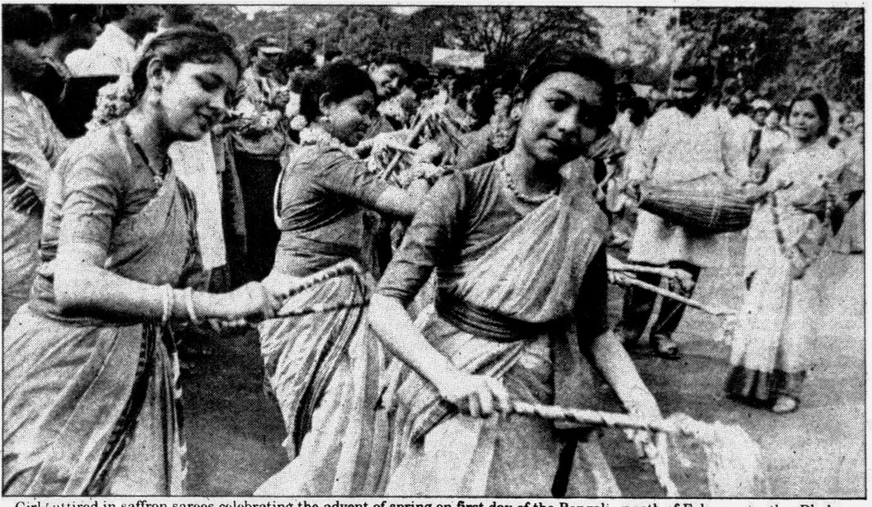
Girls attired in saffron sarees celebrating the advent of spring on first day of the Bengali month of Falgun near the Dhaka University's TSC yesterday.