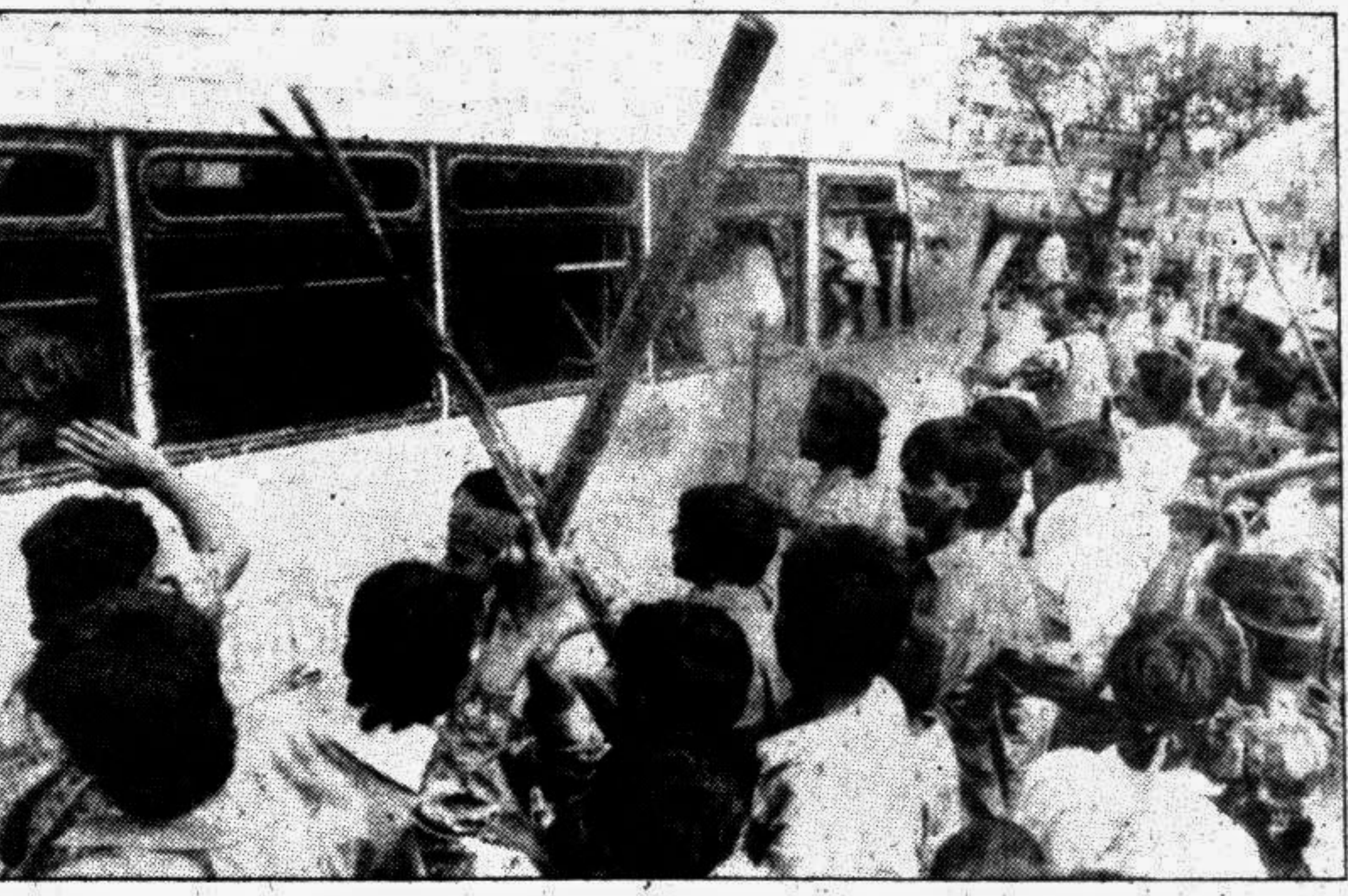
Jute and textile mills workers damaging a bus at Kanchpur near Demra on the Dhaka-Chittagong highway on the first day of their 96-hour strike and road-rail barricade programme yesterday.

By Staff Correspondent Robin Gray, New Zealand's State Minister for Foreign Affairs and Trade, is due to arrive in Dhaka on a day's official visit on February 18. It was learnt yesterday. The visit, first by a New Zealand minister, is expected to focus on bilateral trade and economic relations between the two countries. Robin Gray will hold talks See Page 12 Col 6