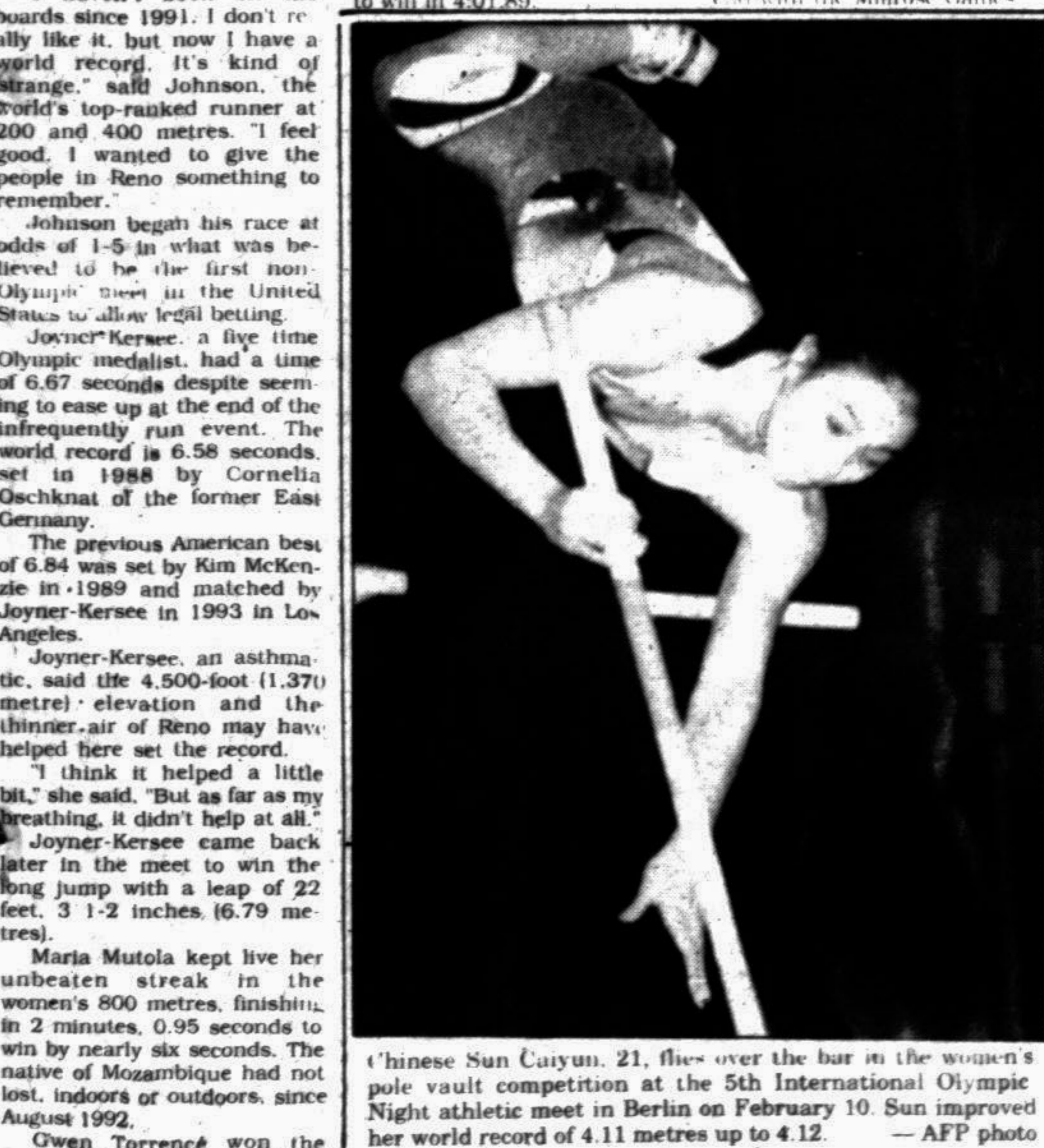
Chinese Sun Cuiyun, 21, flies over the bar in the women's pole vault competition at the 5th International Olympic Night athletic meet in Berlin on February 10. Sun improved her world record of 4.11 metres up to 4.12.

RENO, Nevada, Feb 11: Record-setting performances by Michael Johnson and Jackie Joyner-Kersee stole the spotlight in a meet dominated by glitz and gambling, reports AP.