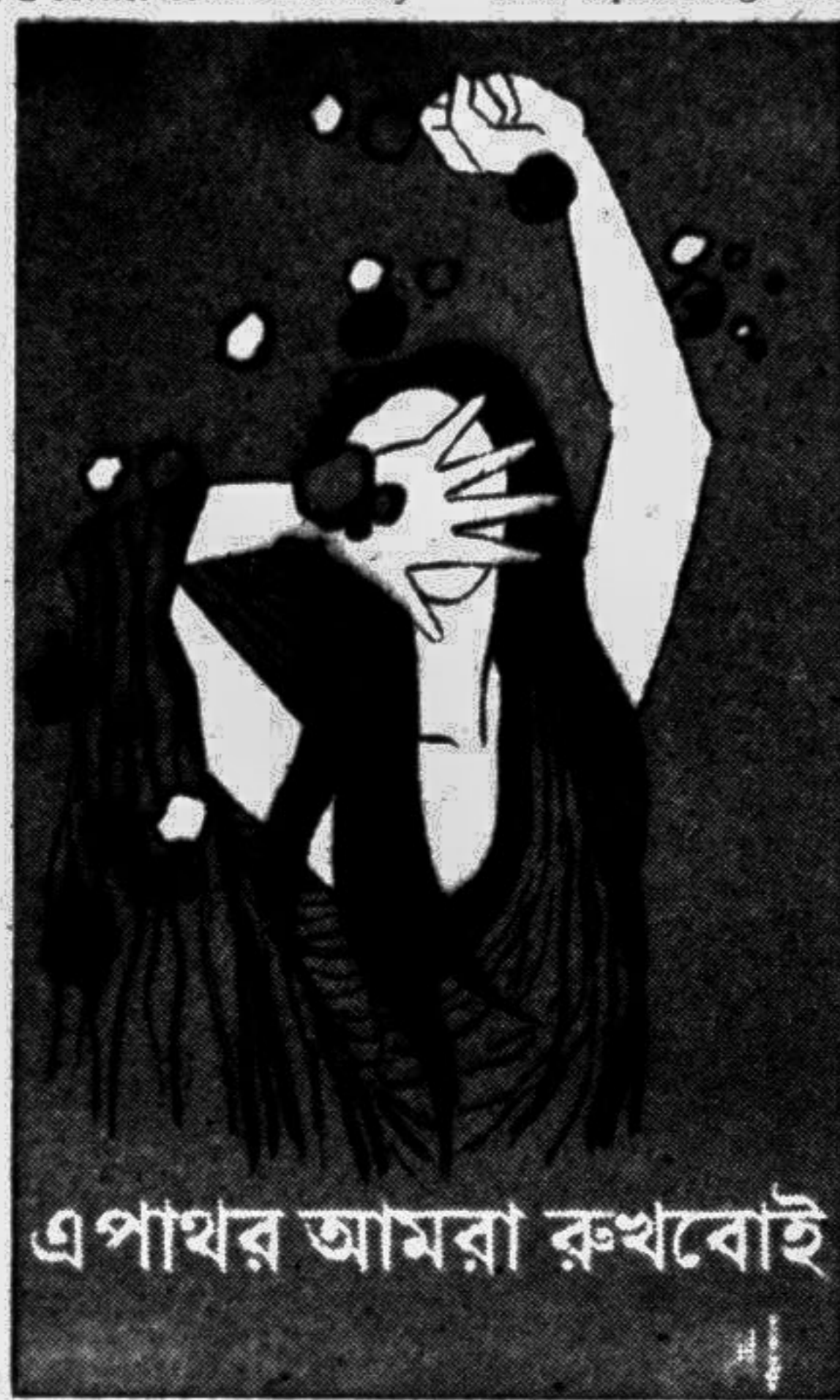
এ পাথর আমরা রাখবোই

When you visit the Ekushey Boi Mela, be sure to stop at the feminist book stall. Here the spirit of Ekushey, and the spirit of the women's movement in Bangladesh are kept alive and kicking.