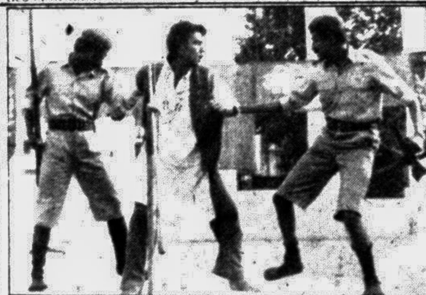
A sequence of the play Raktakta Fulgona staged at the altar of the Central Shaheed Minar on the third day, yesterday, of the 12-day programme organised by the Sammilito Sangskritik Jote.

House of Debaters, a Dhaka University-based platform of debaters, has produced the film based on debating, its evaluation, heritage and activities of debaters in the country.