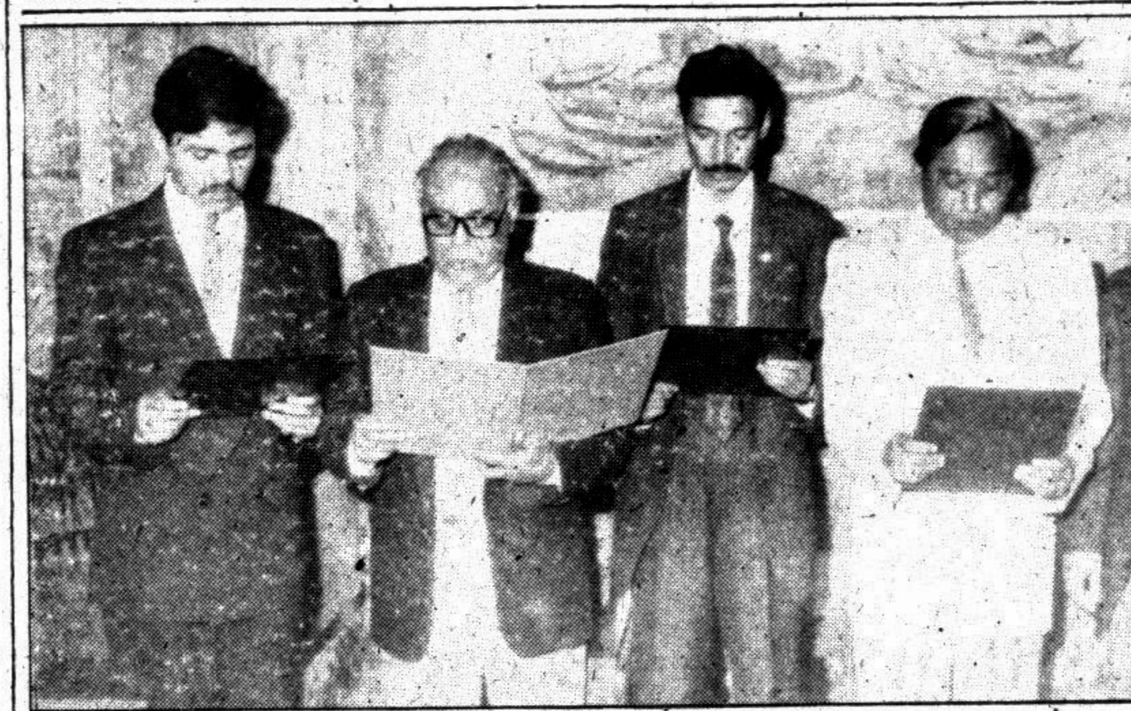
Speaker Shaikh Razzak Ali administered the oaths of office to three newly-elected members of Parliament at a ceremony at his Jatiya Sangsad yesterday.