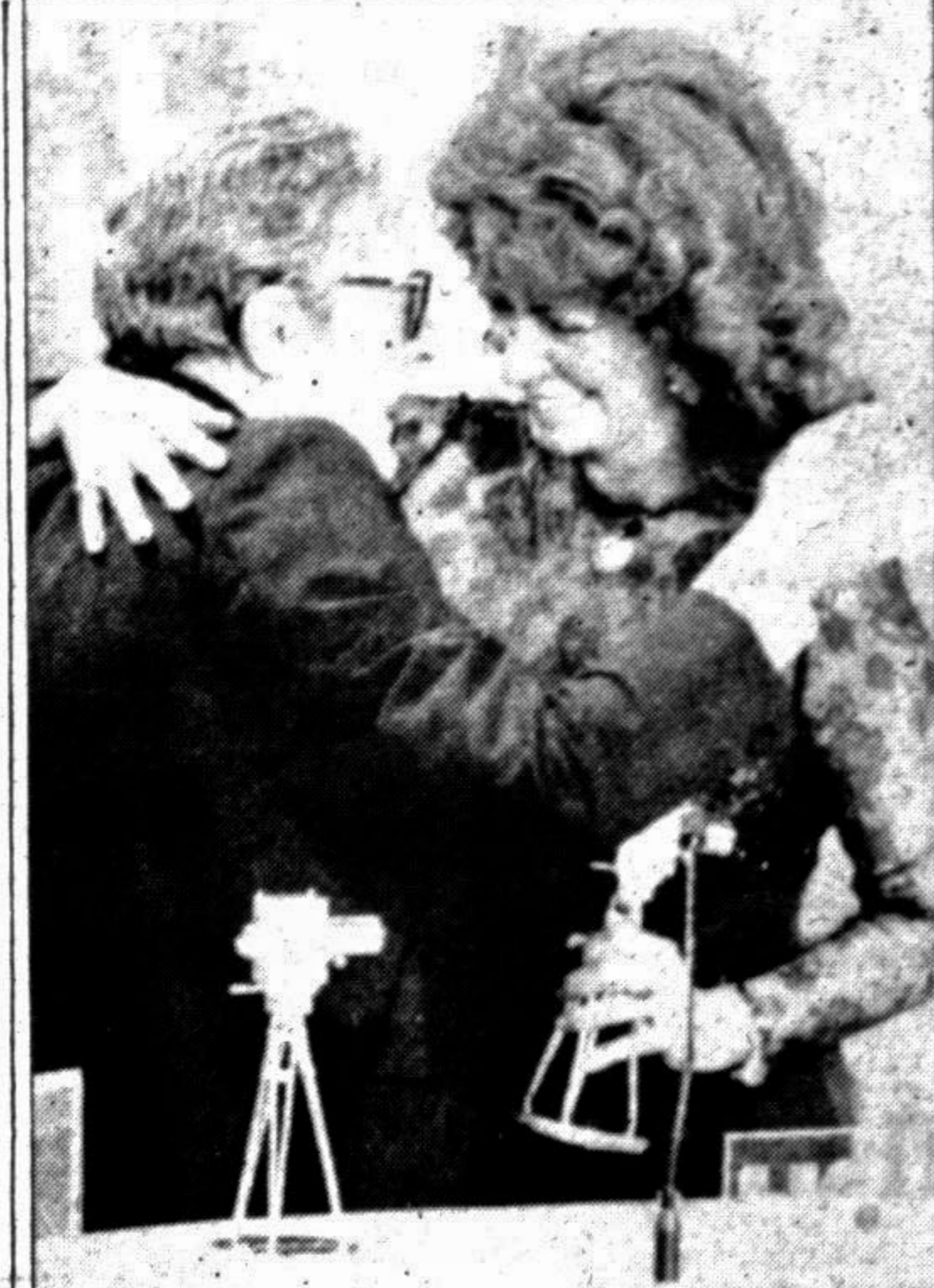
Italian actress Sophia Loren and actor Marcello Mastroianni embrace each other after receiving the "Golden Camera" award of the German magazine "Hoer Zu" for their lifetime achievements in cinema in Berlin Wednesday.

The minister said the enhancement of financial benefits of the workers is related with the increase of production in the mills and increase of pro-